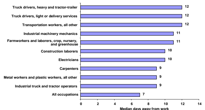
Occupations with the highest median days away from work, 2004