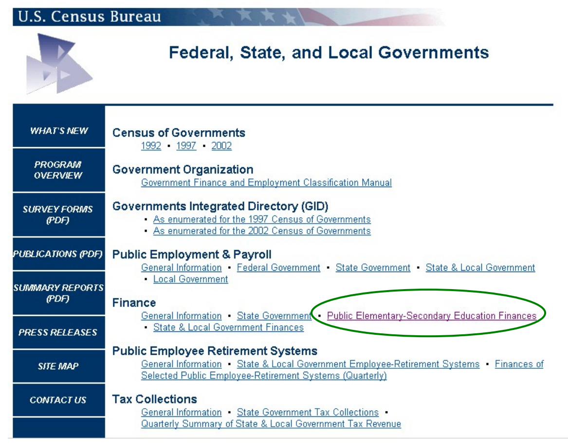
Figure 4. Screen shot of the Federal States and Local Governments page, one link in off of the Census.gov home page.

4. What percent of the elementary and secondary public school funding comes from the federal government?