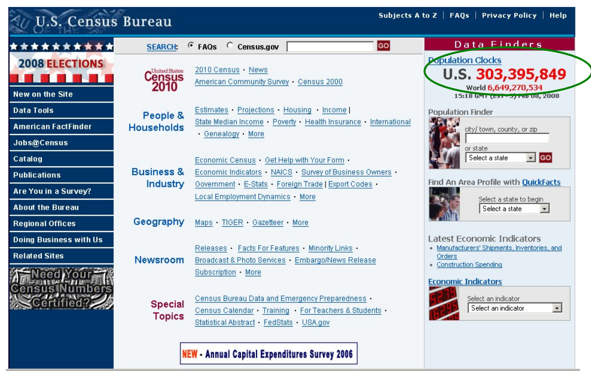
Figure 1. Screen shot of the Census Bureau home page, current population circled.