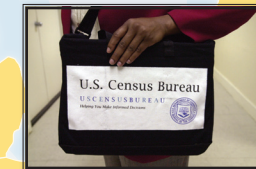
Census Enumerator Bag

Residents of Fayetteville and Eastern NC: