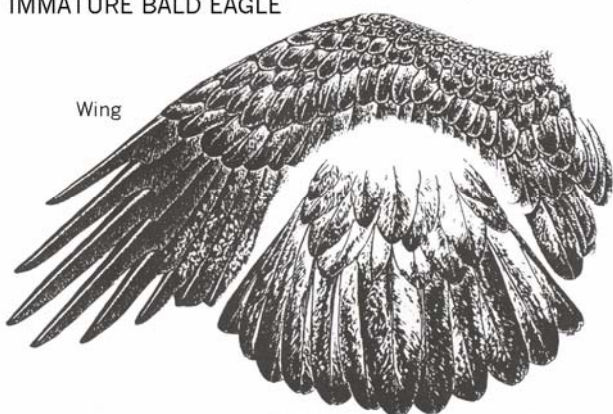
Tail - black and white streaked