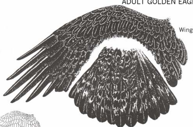
Tail - dark brown with marbling pattern