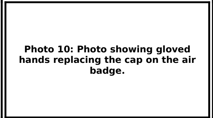
Photo 10: Photo showing gloved hands replacing the cap on the air badge.