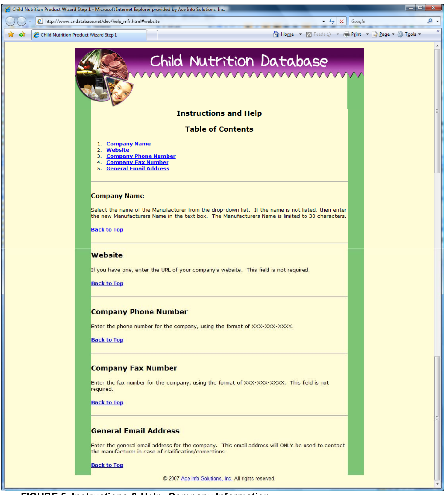
FIGURE 5. Instructions & Help: Company Information