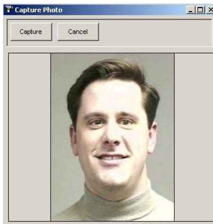
Figure 3. Capture Photo Screen