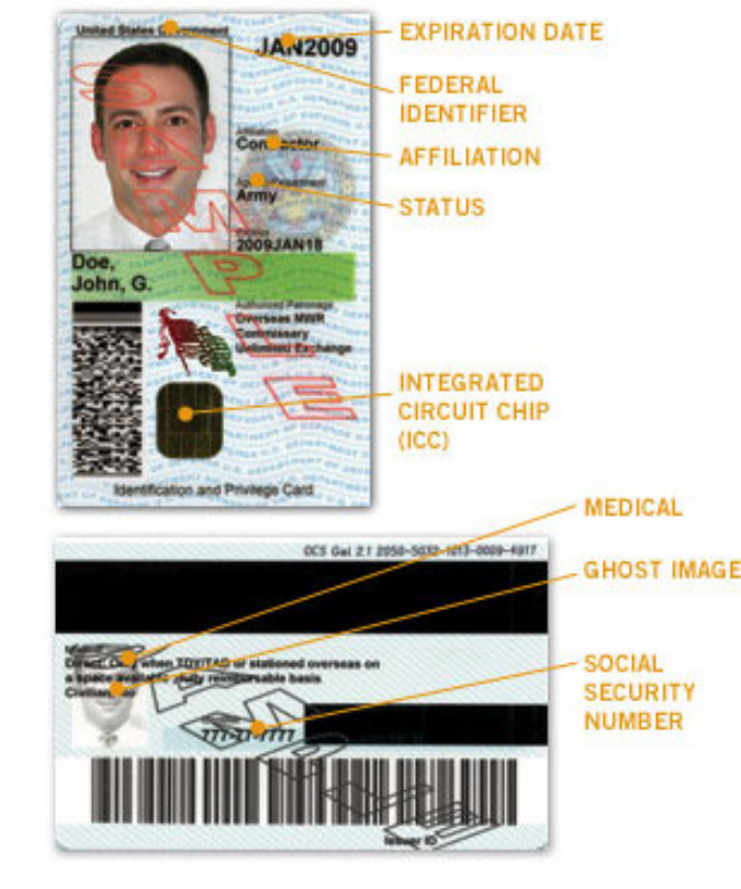
Figure 3. U.S. DoD and/or Uniformed Services ID and Privilege Card

c. U.S. DoD and/or Uniformed Services ID and Privilege Card. The CAC shall be issued according to Reference (s). This card shall be the primary ID card granting applicable benefits and privileges for civilian employees, contractors, and foreign national military, as well as other eligible personnel in the following categories: