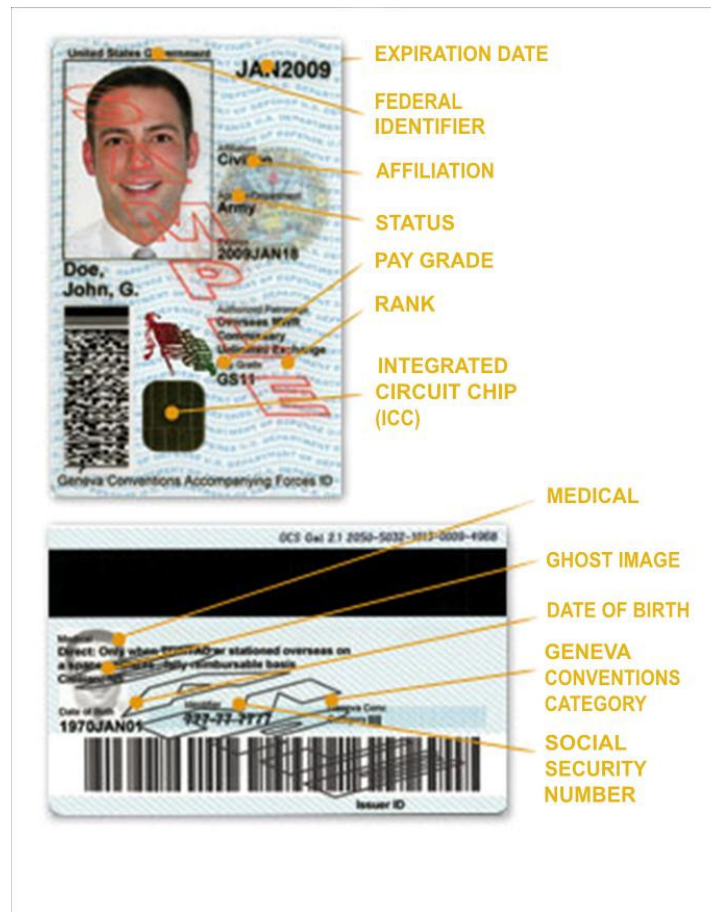
Figure 2. U.S. DoD/Uniformed Services Geneva Conventions ID Card for Civilians Accompanying the Armed Forces

b. U.S. DoD/Uniformed Services Geneva Conventions ID Card for Civilians Accompanying the Armed Forces . The CAC serves as the U.S. DoD and/or Uniformed Services Geneva Conventions identification card for civilians accompanying the Armed Forces and shall be issued according to Reference (v).