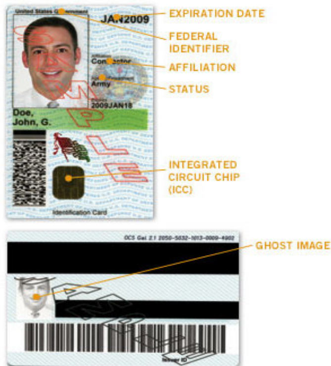
Figure 4. U.S. DoD/Uniformed Services ID Card

d. U.S. DoD/Uniformed Services ID Card . This CAC shall be the primary ID card for eligible civilian employees, contractors, and foreign national affiliates that do not receive the identification and privilege CAC.