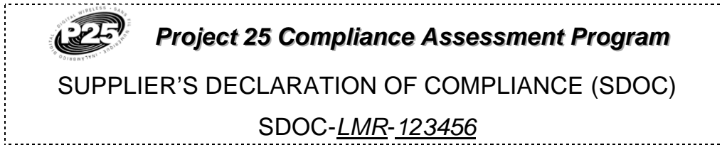
Figure 1. P25 CAP Letterhead and Title

The SDOC document begins with the P25 CAP letterhead, title, and SDOC document identification, as illustrated in figure 1.