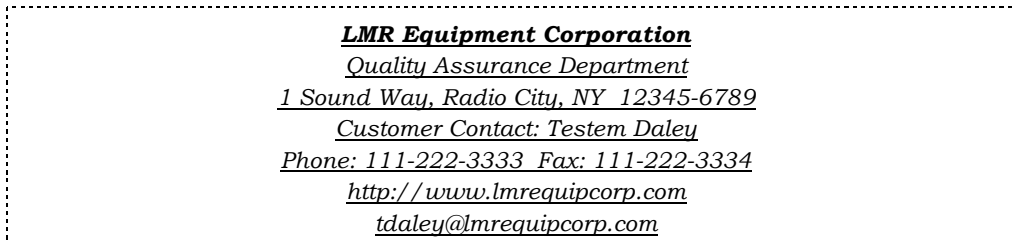
Figure 2. Company Information

Company information for the manufacturer of the land mobile radio (LMR) product appears at the top of the document, just below the P25 CAP letterhead and title. This information includes the company's name, address, department, and Web address as well as the name, phone number, fax number, and e-mail address of the customer contact. Figure 2 demonstrates how to present this information: