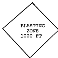
About 48" x 48"

(ii) Specimens of signs which would meet the requirements of paragraph (k)(3) of this section are the following: