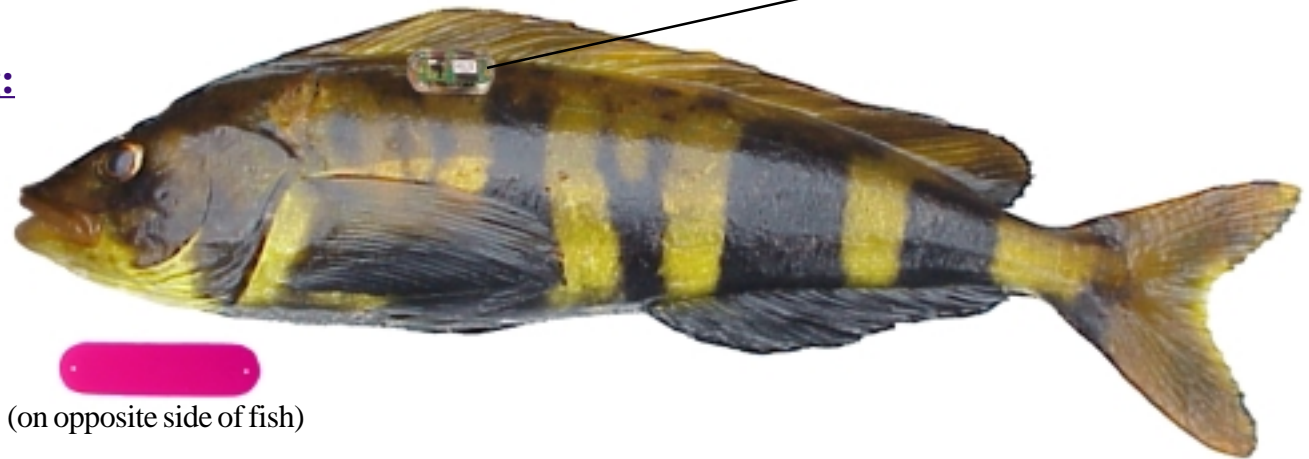
Electronic data tag