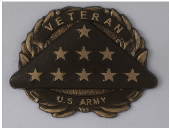
Five or Three inch Bronze Medallion

For deaths occurring on or after November 1, 1990 - Furnished upon receipt of claim for affixing to a privately purchased monument of any eligible deceased Veteran. Eligible Veterans are entitled to a Government furnished headstone or marker, or the medallion, but not both. If requesting a headstone or marker, please use the VA Form 40-1330. The medallion is available in three sizes: 5 inches, 3 inches, and 1-1/2 inches. Each medallion is inscribed with the word VETERAN across the top and the Branch of Service at the bottom ( See Note in Block 7 of the form for further information ).