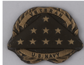
One and a half inch Bronze Medallion

DELIVERY AND INSTALLATION - The medallion is shipped without charge to the applicant designated in block 9 or the alternate in Block 14 of the claim. The Government is not responsible for costs to affix the medallion on the privately purchased headstone or marker. Appropriate affixing adhesives, hardware and instructions are provided with the medallion.