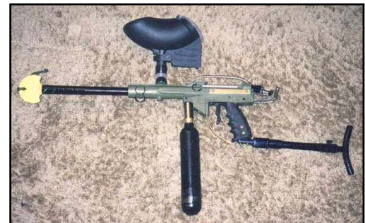
Figure 2: Paintball Marker with a Vertical Bottle Attachment

Paintball marker propellant – propellant consists of CO<sub>2</sub> cylinder, air cylinder, long barrel pump-action, and high pressure or nitro bottles. Propellant cylinders are either vertically or horizontally attached to the paintball marker. A horizontally attached cylinder is also called a bottom line bottle attachment.