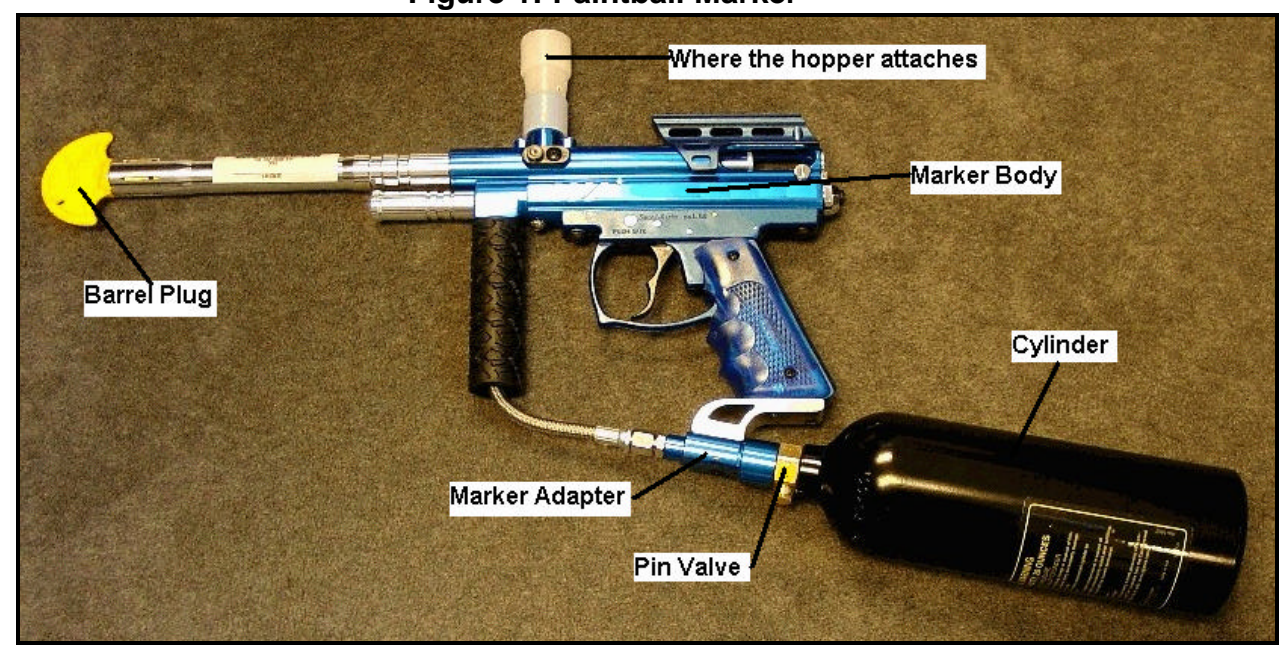
Figure 1: Paintball Marker

A common hazard pattern is intentional or accidental firing of a paintball into a body part (usually face or eye). Paintball markers are activated by a trigger much like BB-guns. A paintball marker consists of the marker body (which looks like a gun), a cylinder (which contains compressed gas for propelling the paintball pellets), and a hopper (which acts as a magazine for holding the paintball pellets) (see Figure 1).