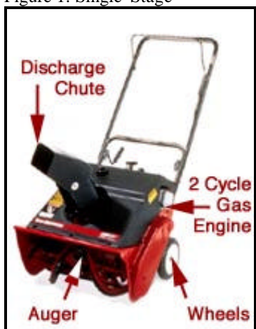
Figure 1: Single-Stage