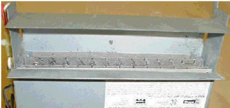
Photograph 2: Close up view of the heating element on the incident heater.