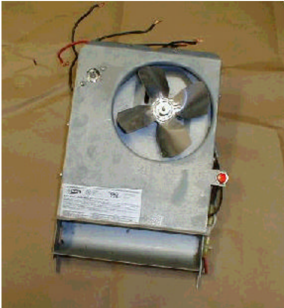
Photograph 1: Photograph shows a front view of the electric forced air heater involved in this IDI.