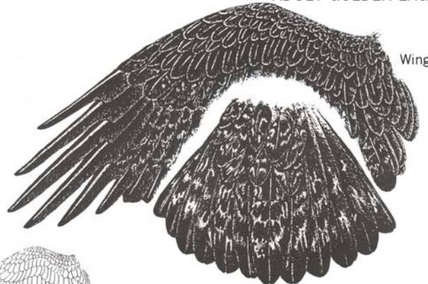
Tail - dark brown with marbling pattern