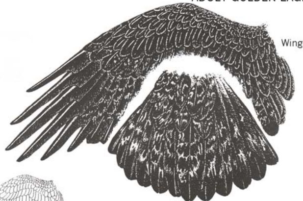
Tail - dark brown with marbling pattern