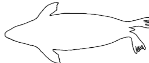
Circle one : Dorsal / Ventral

Sketch and describe ID characteristics, overall body condition, note any scavenger damage and/or decomposition, new and/or healed wounds, any gear on the animal, etc: