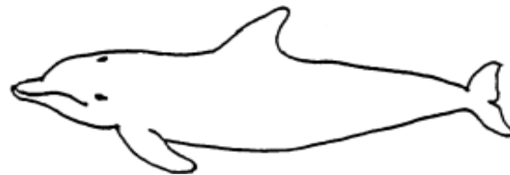
Circle one : Left / Right