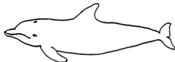
Circle one : Left / Right