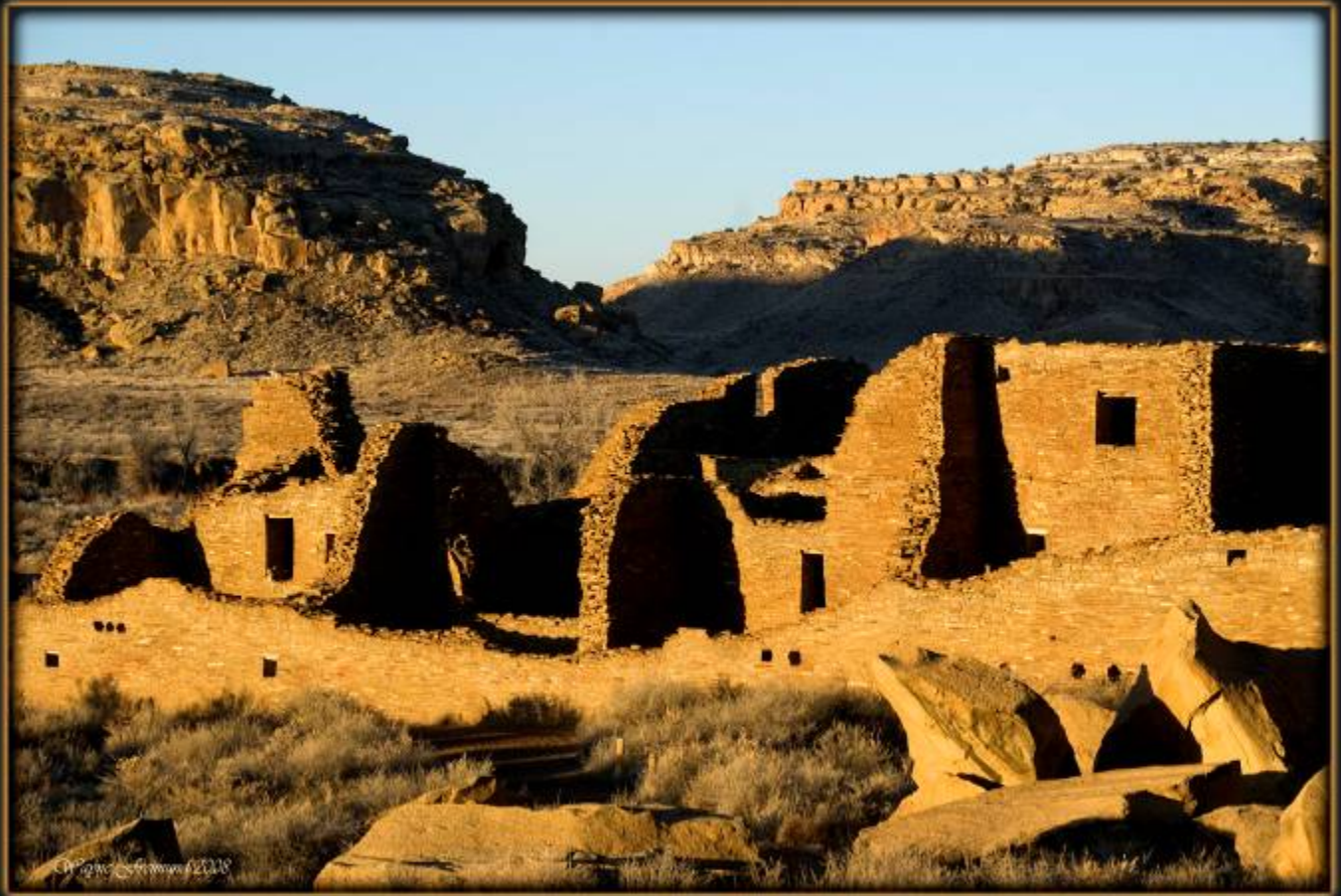
Chaco Culture National Historical Park