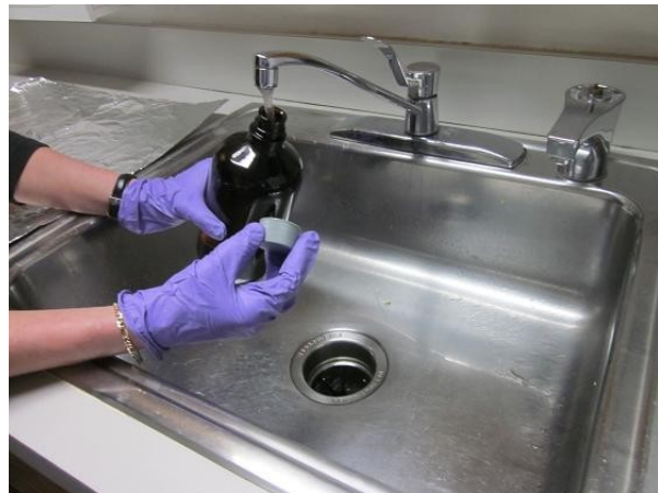
Photo 3. Bottle filling with water

Call the number on page 5 if you have any questions about the TWF sample.