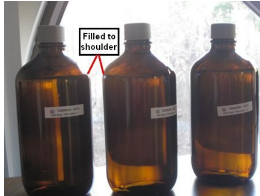
Photo 4. Three bottles filled to the shoulder with water with labels