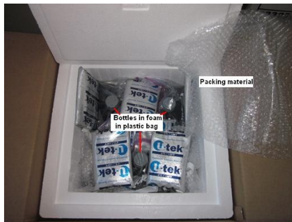
Photo 5. Bottles in foam inserts packed in ice packs.