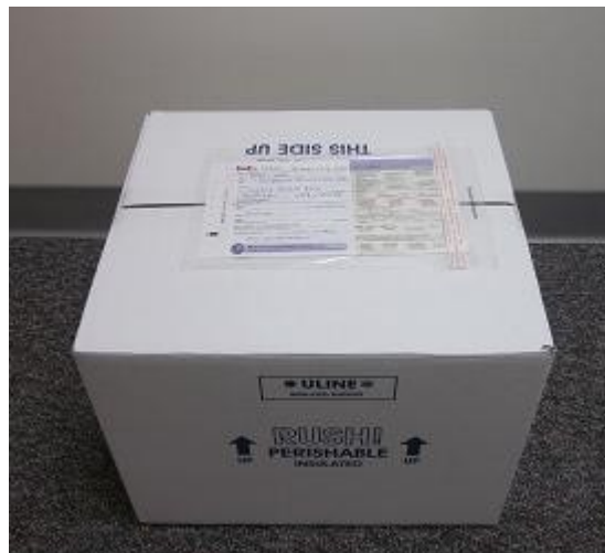
Photo 6. Ensuring label is attached to FedEx box.

Call the number on page 5 if you have any questions about the TWF sample.