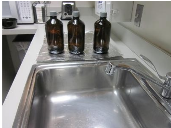
Photo 2. Foil with water pesticide collection bottles