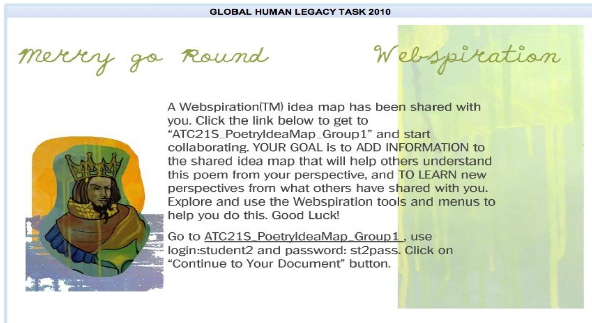
Figure 2. Screenshot of a sample task from the Webspiration scenario