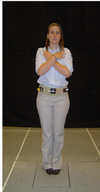
Pose 1: flat surface, feet together, eyes open

If the participant is not ready by the end of the one-minute rest period, the test is discontinued . In such a case, the examiner should say, “Let’s go on to another activity,” and should note the reason for stopping the test on the examiner’s screen.