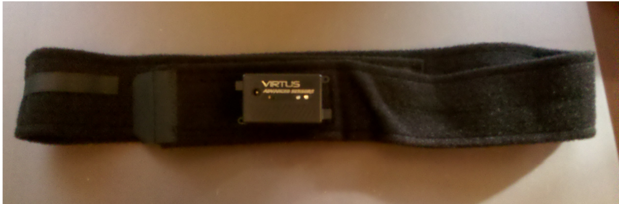
Figure 1: Accelerometer unit attached to gait belt.

Description: This task is designed to assess postural sway and to determine participants' vestibulo-spinal function. Children ages 3-6 are asked to complete the first 4 poses; participants ages 7 years and older should complete all 6 poses.