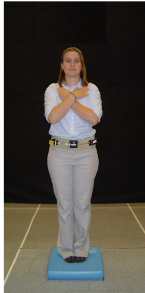
Pose 3: foam surface, feet together, eyes open

*Discontinue rule 2: If the participant cannot successfully complete either trial of pose 2, he/she will not be asked to perform any more poses with eyes closed (i.e., will not be administered poses 4 or 6).