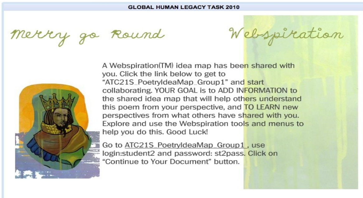
Figure 2. Screenshot of a sample task from the Webspiration scenario