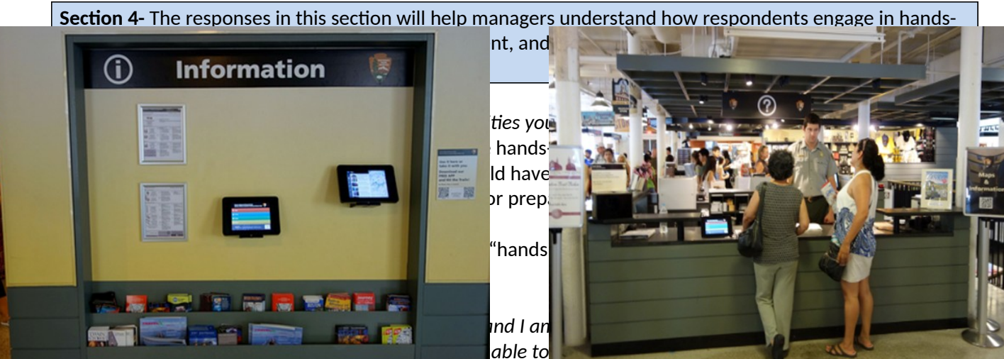
<u>used in section 3 above</u>, the interviewer will pick one of the three photos selected and continue the questioning.)