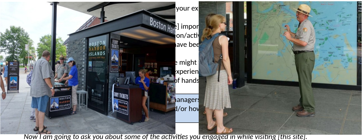
Probe 1: Please tell me about some of the ways you experienced self-discovery while onsite.