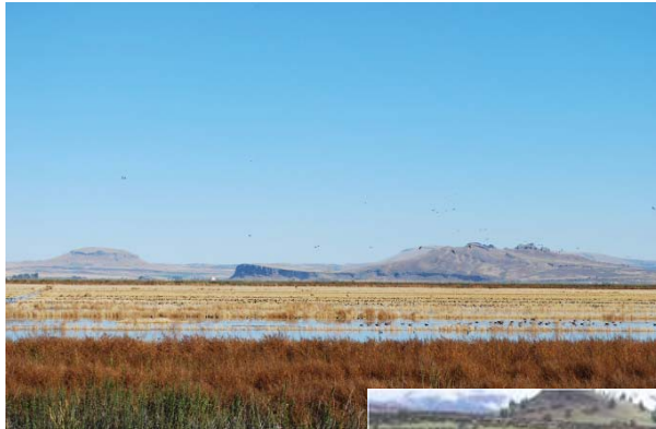
Upper Klamath Basin (Oregon)

The federal government is considering plans for restoring this river basin and its fish populations. Understanding the views of households like yours will help the government choose the best option.