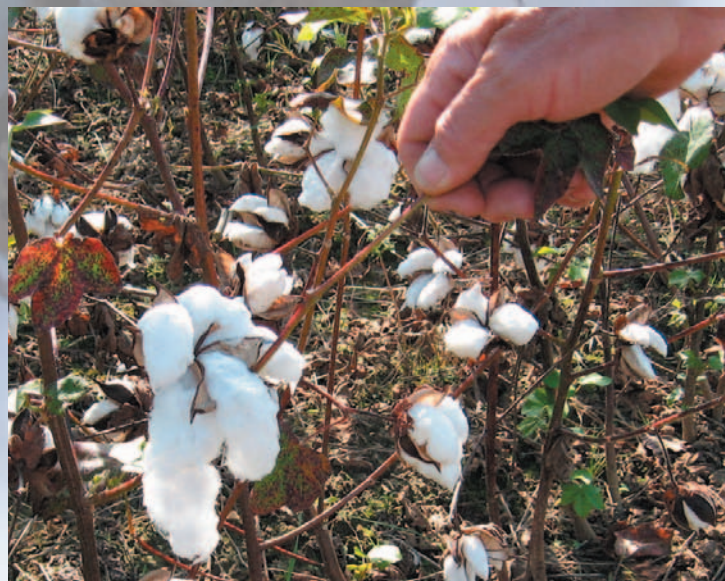
This boll is counted as an open boll even though one attached lock is hanging from the boll.