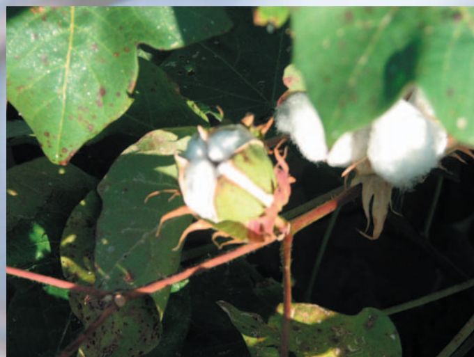
A partially open boll will have green tinted carpel walls and some cotton visible but it is not sufficiently open for harvesting. An open boll will have all the locks intact and be open sufficiently to allow for normal harvesting.