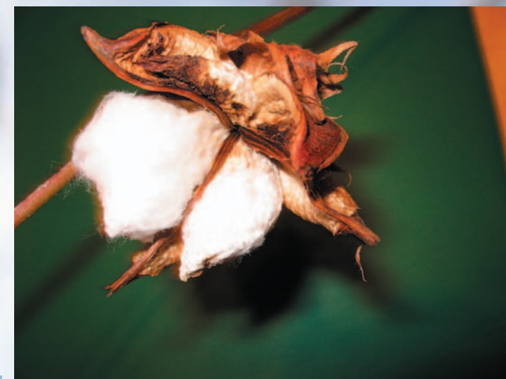
This is an open boll and not a burr. Portions of its locks have been damaged and will be removed in the ginning process. Remove the damaged portions from the ginnable cotton before weighing.