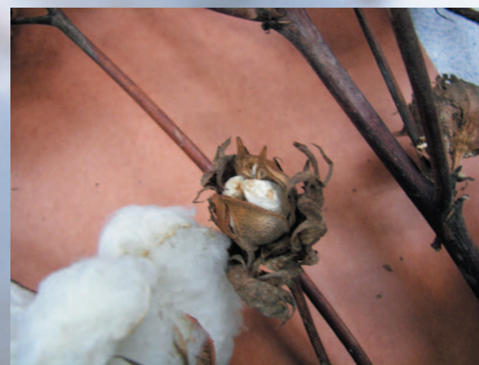
This boll needs careful examination for proper classification. Since it is doubtful that a picker will even pick the locks which may have ginnable cotton, classify this boll as damaged. However, if the boll is likely to be stripped and there is ginnable cotton in the locks, classify it as an open boll – but never a partially open boll or burr.