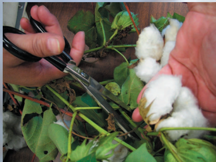
Clip, pick and weigh all open bolls in the 10-foot count section