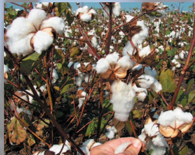
Bolls with one or more locks missing either on the ground or on the plant are classified as burrs. Intact open bolls on the ground in the unit are also counted as burrs. Bolls with locks damaged by insects or disease are not burrs; they are open bolls. Do not count an unopened boll on the ground if it was there before you arrived. But, if it falls while you are making observations, it must be counted.