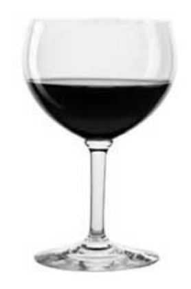
1 Shot of Liquor (Whisky, Vodka, Gin, etc.) 1.5 oz.