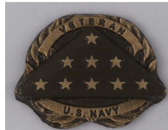
One-and-one-half inch Medallion

WHO IS ELIGIBLE - Any deceased Veteran discharged under conditions other than dishonorable who died on or after November 1, 1990 and is buried in a private cemetery in a grave marked with a privately-purchased headstone or marker. A copy of the deceased Veteran's discharge certificate (DD Form 214 or equivalent) or a copy of other official document(s) establishing qualifying military service must be attached. Do not send original documents; they will not be returned. Service after September 7, 1980, must be for a minimum of 24 months continuous active duty or be completed under special circumstances, e.g., death on active duty. Persons who have only limited active duty service for training while in the National Guard or Reserves are not eligible unless there are special circumstances, e.g., death while on active duty, or as a result of training. Reservists and National Guard members who, at time of death, were entitled to retired pay, or would have been entitled, but for being under the age of 60, are eligible; a copy of the Reserve Retirement Eligibility Benefits Letter must accompany the claim. Reservists called to active duty and National Guard members who are Federalized and who serve for the period called are eligible.