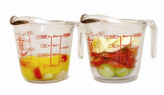
1 1/2 cups