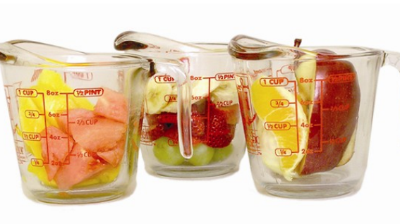
3 cups or more