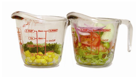
1 1/2 cups