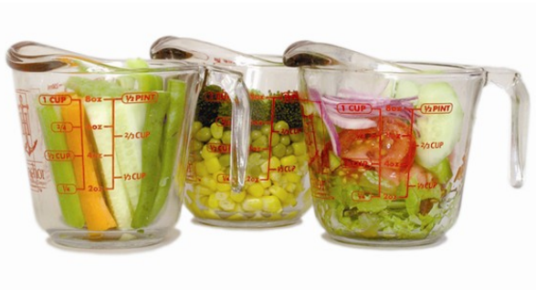
3 cups or more