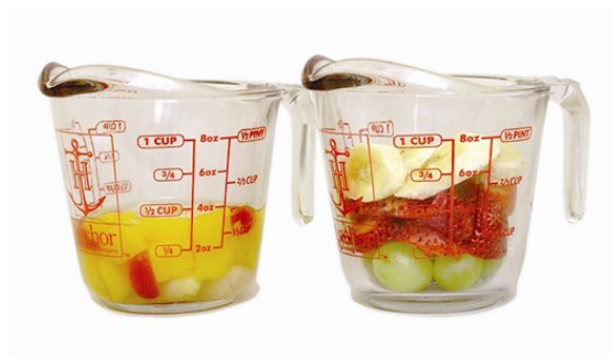
1 1/2 cups