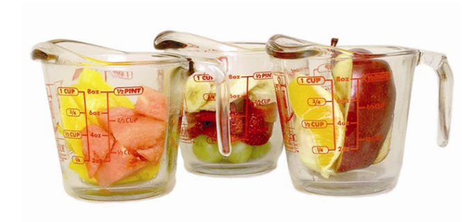
3 cups or more