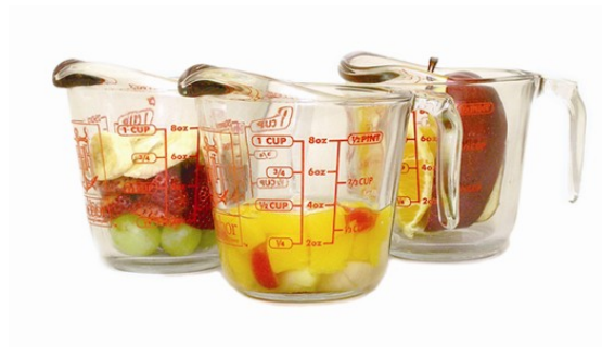
2 1/2 cups