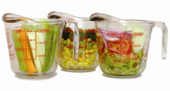
3 cups or more