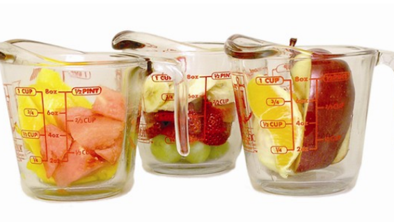
3 cups or more