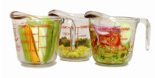
2 1/2 cups