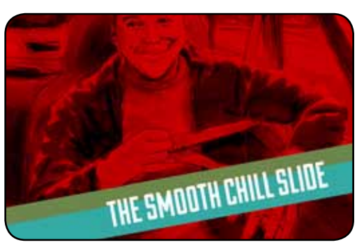
Freeze-frame, super: THE SMOOTH CHILL SLIDE

Cut to another driver. He looks in his rear-view, notices a cop, and slyly guides his right arm under his left arm to grab the seatbelt.