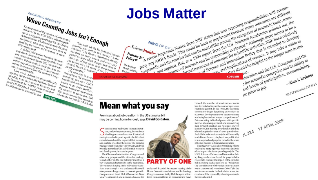
Figure 1: Articles in Science and Nature on science job creation

Use of the data The administration has committed to producing an open, transparent and auditable set of reports of the impact of ARRA on job creation. In addition, as noted in Figure 2, the media has asked important questions about the impact of federal investments in science, particularly with respect to job creation and economic growth. It is important to collect and analyze data so that such questions can be answered in a credible fashion. There is currently no data infrastructure that systematically couples science funding with outcomes.