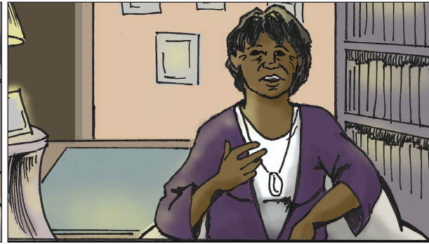
"Well, ok, ok, fear was #1! Yeah, it was fear. But making sure the different specialists and providers involved in my care were on the same page."