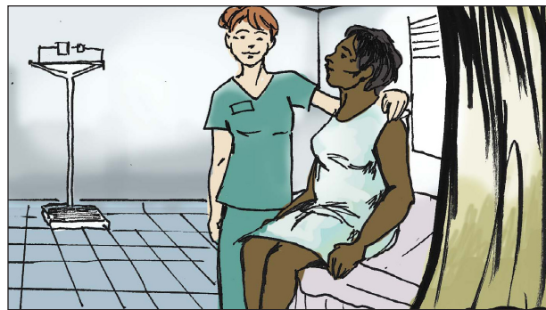
"Fighting cancer is hard enough without having to deal with a mountain, no, make that a Mt. Everest of paperwork."