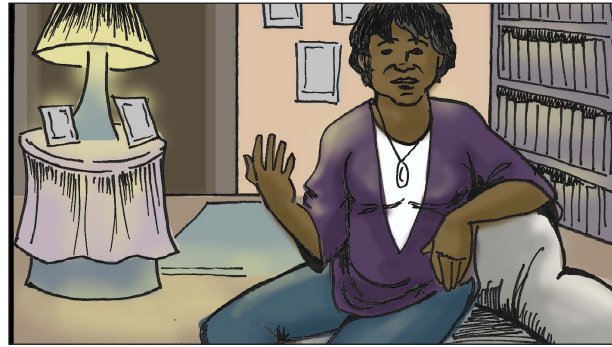
"What was the hardest issue I had to deal with when I was diagnosed with breast cancer? Pfffft. It was probably information overload."