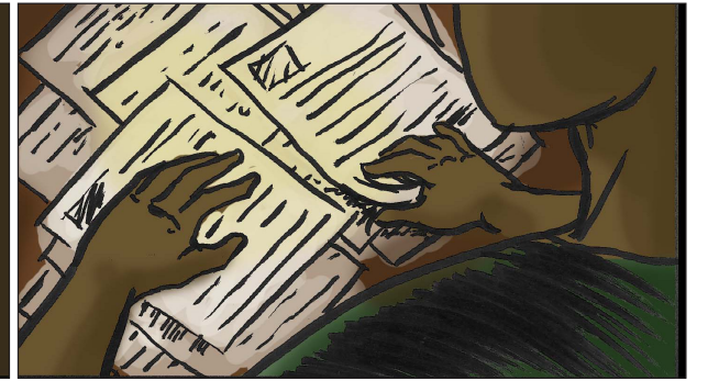
"And I'm the one everybody leans on to keep it all straight."