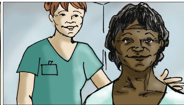
"And honestly, it takes every bit of your strength to concentrate on getting well. Save your energy for what's important. You. "