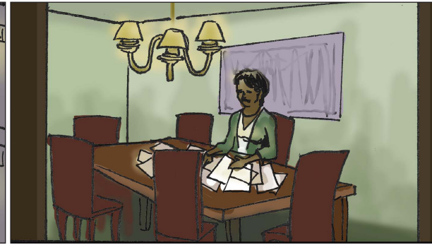
"So many papers, reports, instructions...it was overwhelming "