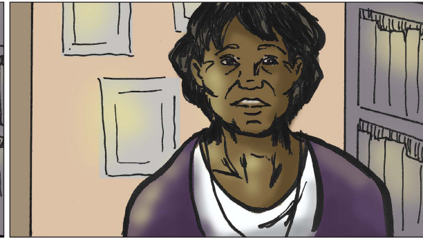
"That was crazy hard. And it was being on the same page that was the problem. "