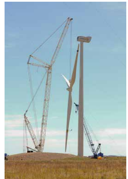
Towers are being lifted as work continues on the 2 MW Gamesa wind turbine that is being installed at the NWTC.