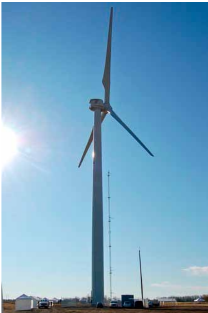
Utility-Scale Wind turbine with an anemometer tower in the background.

energy project is likely to result in take of listed threatened or endangered wildlife species. For more information regarding formal consultation and the requirements of obtaining HCPs, please see the Endangered Species Consultation Handbook at http://www.fws.gov/endangered/esa-library/index.html#consultations and the Service's HCP website, http://www.fws.gov/endangered/what-we-do/hcp-overview.html .