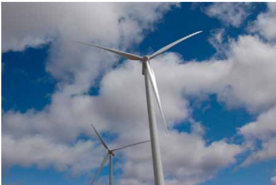
Wind turbines in California.

assessment of risk posed to species of concern and their habitats.