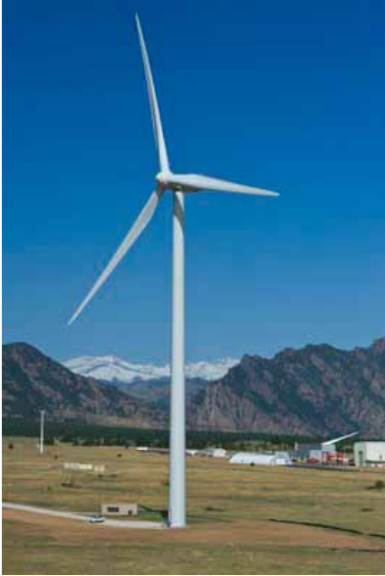
Wind turbine.

projects in similar conditions within the same region are recommended as a basis for determining needed sample size (see Morrison et al., 2008). If data are not available, the Service recommends that an operator select a sufficient number of turbines via a systematic sample with a random start point. Sampling plans can be varied (e.g., rotating panels [McDonald 2003, Fuller 1999, Breidt and Fuller 1999, and Urquhart et al. 1998]) to increase efficiency as long as a probability sampling approach is used. If the project contains fewer than 10 turbines, the Service recommends that all turbines in the area of interest be searched unless otherwise agreed to by the permitting or wildlife resource agencies. When selecting turbines, the Service recommends that a systematic sample with a random start be used when selecting search plots to ensure interspersed among turbines. Stratification among different habitat types also is recommended to account for differences in fatality rates among different habitats (e.g., grass versus cropland or forest); a sufficient number of turbines should be sampled in each strata.