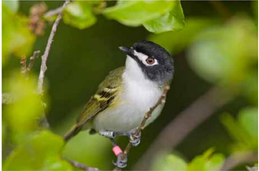
Black-capped Vireo.

Significant direct or indirect loss of habitat for a species of concern may occur without habitat fragmentation if project impacts result in the reduction of a habitat resource that potentially is limiting to the affected population. Impacts of this type include loss of use of breeding habitat or loss of a significant portion of the habitat of a federally or state protected species. This would be evaluated by determining the amount of the resource that is lost and determining if this loss would potentially result in significant impacts to the affected population. Evaluation of potential significant