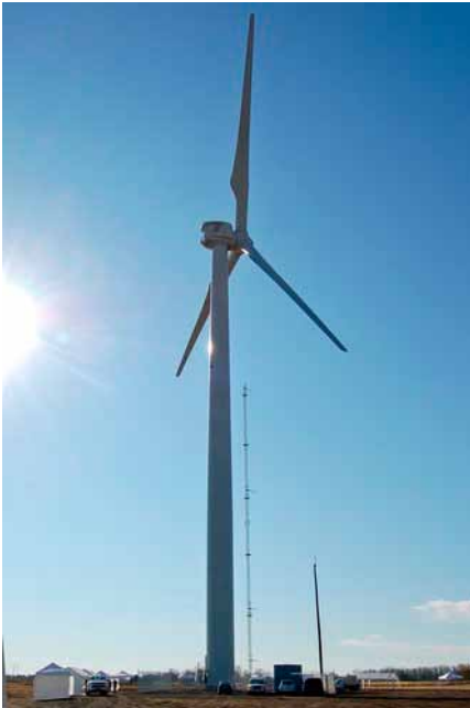
Utility-Scale Wind turbine with an anemometer tower in the background.

energy project is likely to result in take of listed threatened or endangered wildlife species. For more information regarding formal consultation and the requirements of obtaining HCPs, please see the Endangered Species Consultation Handbook at http://www.fws.gov/endangered/esa-library/index.html#consultations and the Service's HCP website, http://www.fws.gov/endangered/what-we-do/hcp-overview.html .