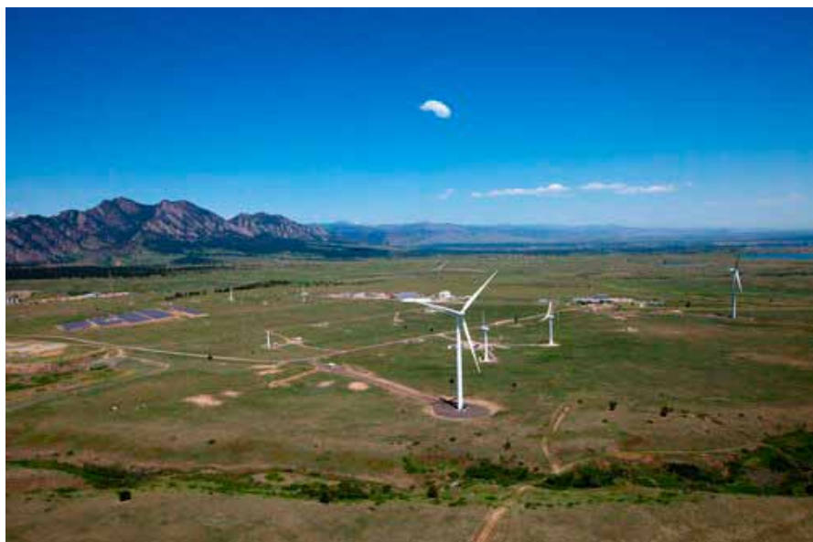
Open landscape with wind turbines.