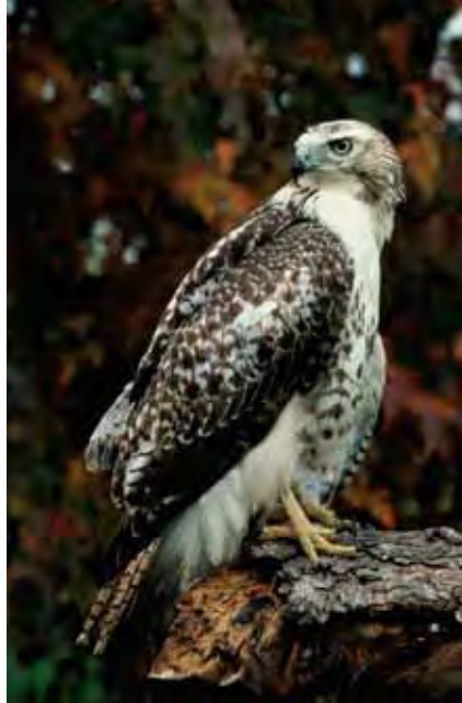
Red-tailed hawk.

An estimate of raptor use of the project site is obtained through appropriate surveys, but if potential impacts to breeding raptors are a concern on a project, raptor nest searches are also recommended. These surveys provide information to predict risk to the local breeding population of raptors, for micro-siting decisions, and for developing an appropriate-sized non-disturbance buffer around nests. Surveys also provide baseline data for estimating impacts and determining mitigation