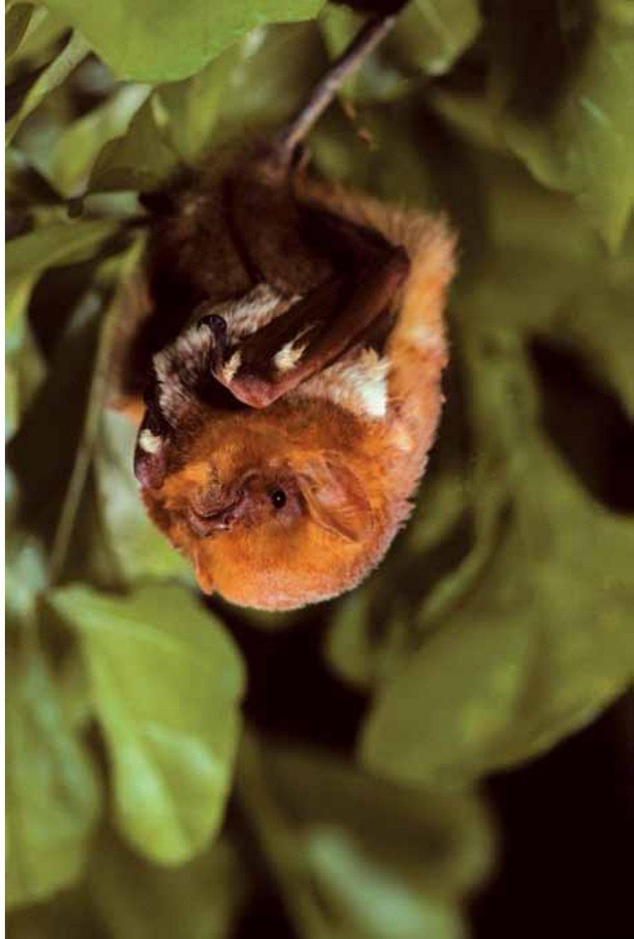
A male Eastern red bat perches among green foliage.

Fatality monitoring should occur over all seasons of occupancy for the species being monitored, based on information produced in previous tiers. The number of seasons and total length of the monitoring may be determined separately for bats and birds, depending on the pre-construction risk assessment, results of Tier 3 studies and Tier 4 monitoring from comparable sites (see Glossary in Appendix A) and