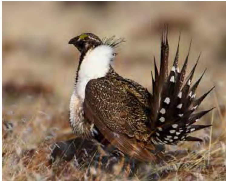
Greater sage grouse