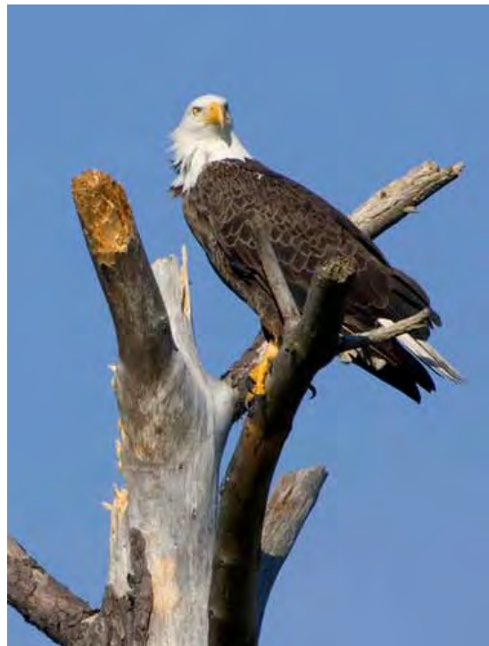
Bald Eagle, Credit: USFWS

In 2009, the Service promulgated a final rule on two new permit regulations that, for the first time, specifically authorize the incidental take of eagles and eagle nests in certain situations under BGEPA. See 50 CFR 22.26 & 22.27. The permits authorize limited, non-purposeful (incidental) take of bald and golden eagles; authorizing individuals, companies, government agencies (including tribal governments), and other organizations to disturb or otherwise take eagles in the course of conducting lawful activities such as operating utilities and airports.