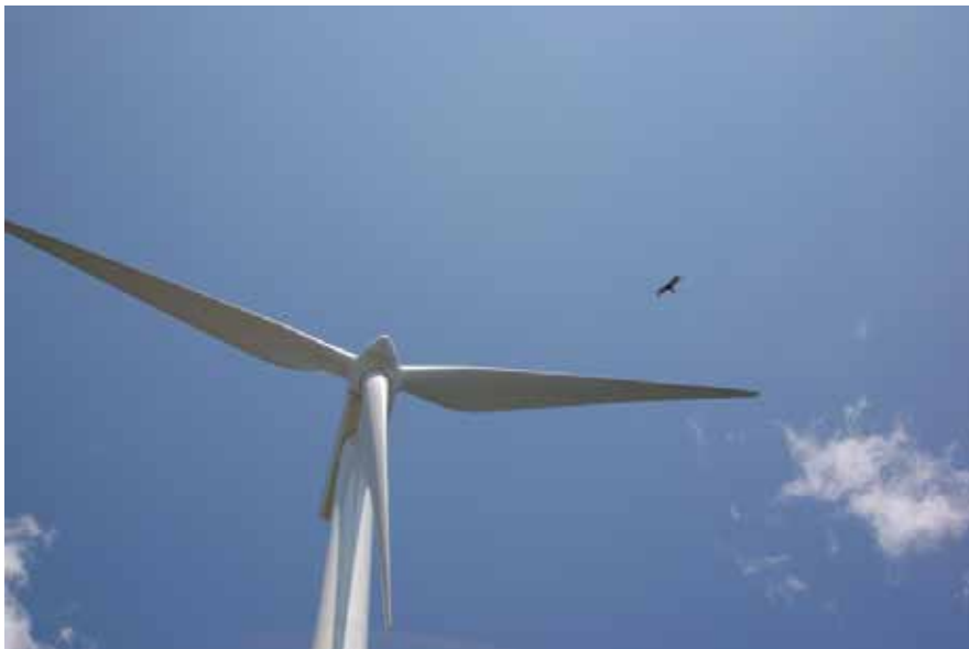
Turkey vulture and wind turbine.

Tier 3 studies address many of the questions identified for Tiers 1 and 2, but Tier 3 studies differ because they attempt to quantify