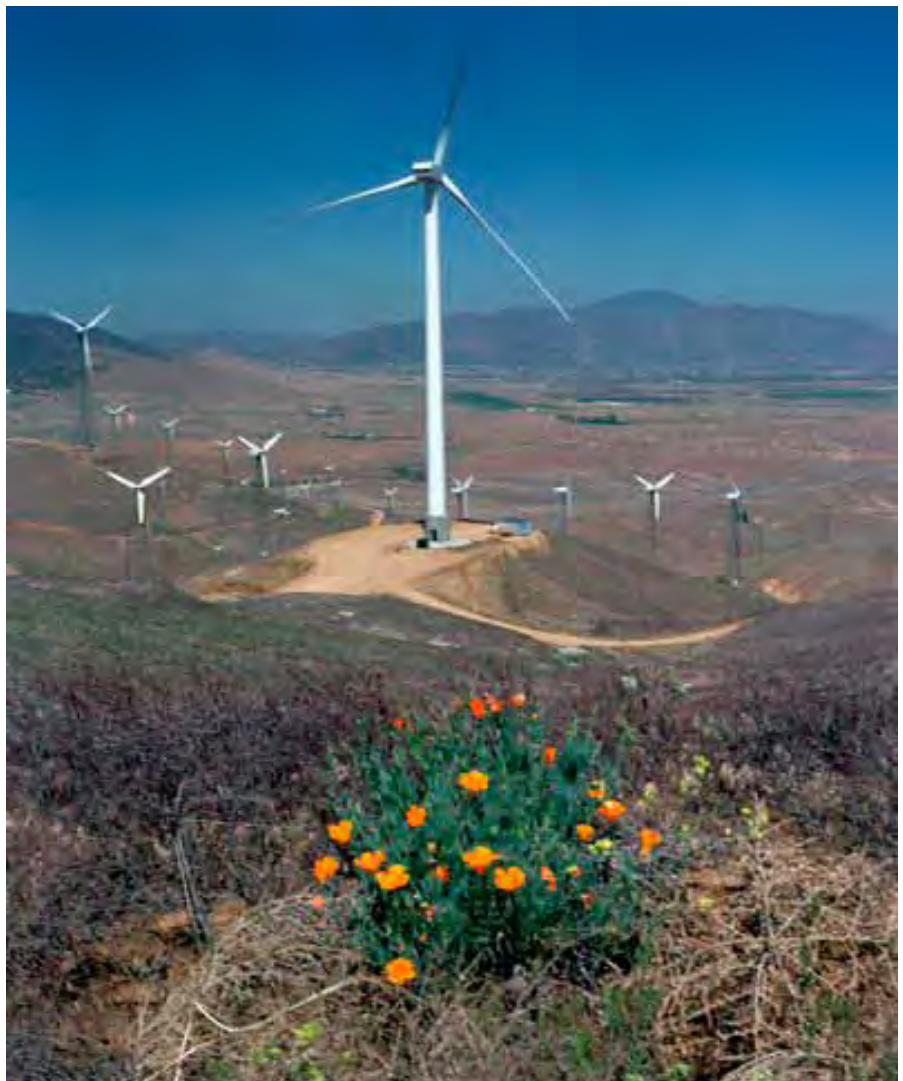
Wind turbines and habitat.

Impacts of a project will have population level effects if the project causes a population decline in the species of concern. For non-listed species, this assessment will apply only to the local population.