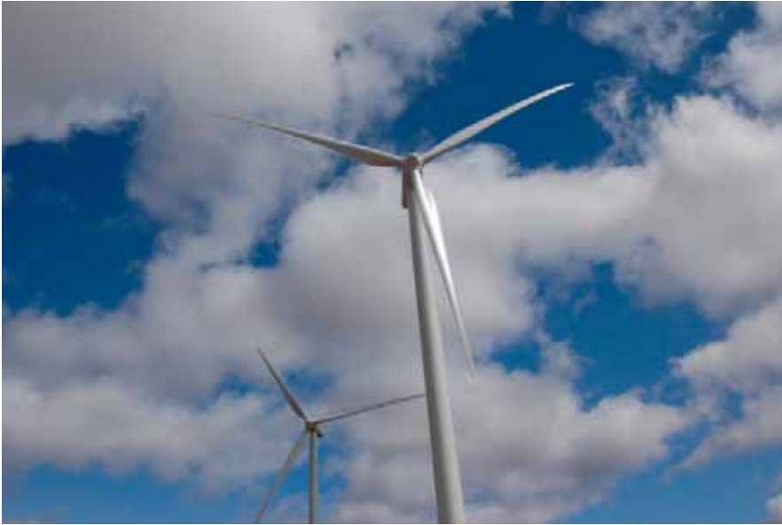
Wind turbines in California.

assessment of risk posed to species of concern and their habitats.