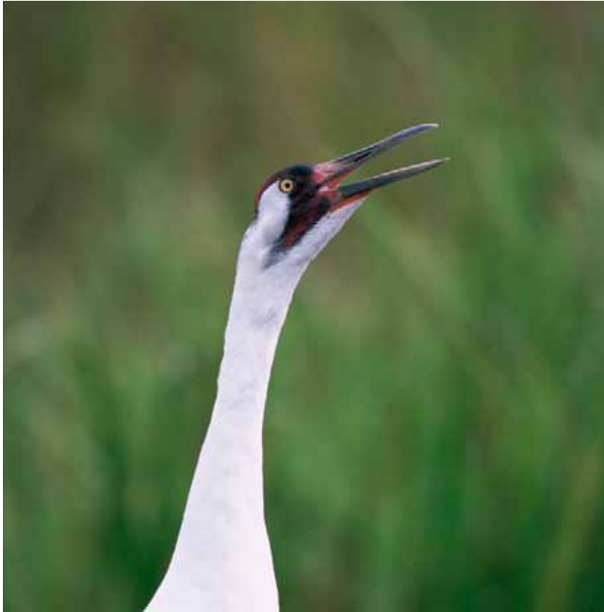
Whooping crane.

and relative abundance require coverage of the wind turbine sites and applicable site disturbance area, or a sample of the area using observational methods for the species of concern during the seasons of interest. As with presence/absence (see Tier 3, question 1, above) the methods used to determine distribution, abundance, and behavior may vary with the species and its ecology. Spatial distribution is determined by applying presence/absence or using surveys in a probabilistic manner over the entire area of interest. Suggested survey protocols for