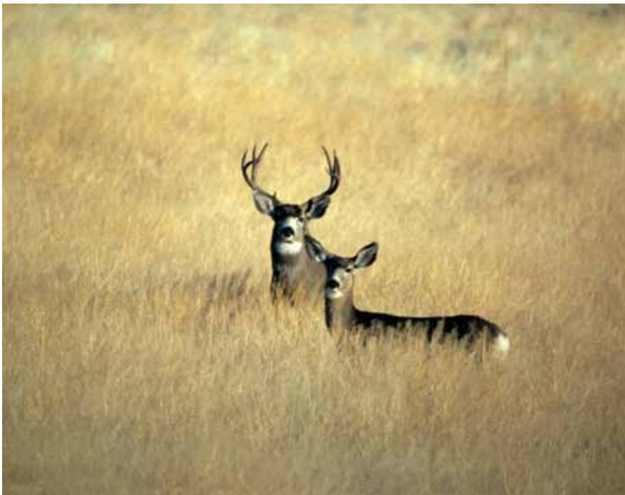
Mule deer.

While the above guidance emphasizes the evaluation of potential impacts to birds and bats, Tier 1 and 2 evaluations may identify other species of concern. Developers are encouraged to assess adverse impacts potentially caused by development for those species most likely to be negatively affected by such development. Impacts to other species are primarily derived from potential habitat loss or displacement. The general guidance on the study design and methods for estimation of the distribution, relative abundance, and habitat use for birds is applicable to the study of other wildlife. References regarding monitoring for other wildlife are available in Appendix C: