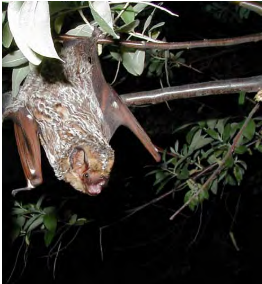
Hoary bat.

The commonly used data collection methods for estimating the spatial distribution and relative abundance of diurnal birds includes counts of birds seen or heard at specific survey points (point count), along transects (transect surveys), and observational studies. Both methods result in estimates of bird use, which are assumed to be indices of abundance in the area surveyed. Absolute abundance is difficult to determine for most species and is not necessary to evaluate species risk. Depending on the characteristics of the area of interest and the bird species potentially affected by the project, additional pre-construction study methods may be necessary. Point counts or line transects should collect vertical as well as horizontal data to identify