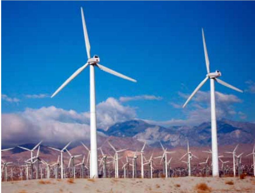
Rows of wind turbines.

Studies to assess impacts may include quantifying species' habitat loss (e.g., acres of lost grassland habitat for grassland songbirds) and habitat modification. For example, an increase in edge may result in greater nest parasitism and nest predation. Assessing indirect impacts may include two important components: 1) indirect effects on wildlife resulting from displacement, due to disturbance, habitat fragmentation, loss, and alteration; and 2) demographic effects that may occur at the local, regional or population-wide levels due to reduced nesting and breeding densities, increased isolation between habitat patches, and effects on behavior (e.g., stress, interruption, and modification). These factors can individually or cumulatively affect wildlife, although some species may be able to habituate to some or perhaps all habitat changes. Indirect impacts may be difficult to quantify but their effects may be significant (e.g., Stewart et al. 2007, Pearce-Higgins et al. 2008, Bright et al. 2008, Drewitt and Langston 2006, Robel et al. 2004, Pruett et al. 2009).