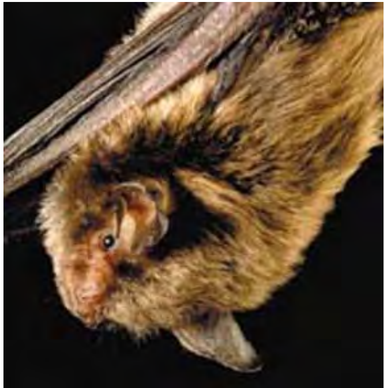
Indiana bat.

The Endangered Species Act (16 U.S.C. 1531–1544; ESA) was enacted by Congress in 1973 in recognition that many of our Nation’s native plants and animals were in danger of becoming extinct. The ESA directs the Service to identify and protect these endangered and threatened species and their critical habitat, and to provide a means to conserve their ecosystems. To this end, federal agencies are directed to utilize their authorities to conserve listed species, and ensure that their actions