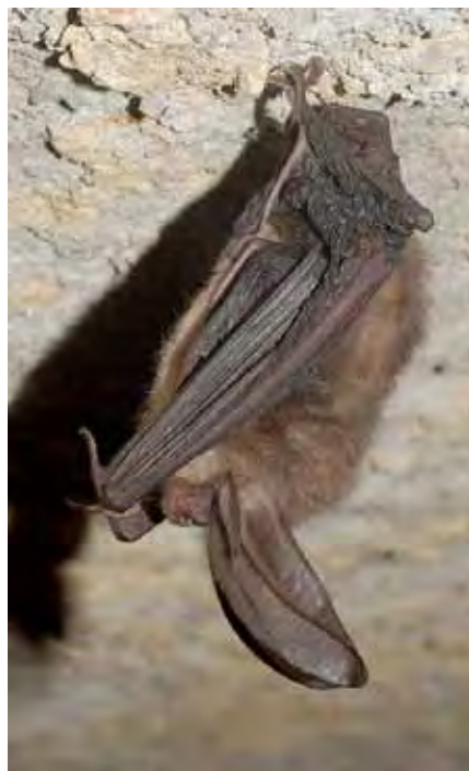
Virginia big-eared bat.

post-construction data in the areas of interest and reference areas is possible, then the Before-After-Control-Impact (BACI) is the most statistically robust design. The BACI design is most like the classic manipulative experiment. 6 In the absence of a suitable reference area, the design is reduced to a Before-After (BA) analysis of effect where the differences between pre- and post-construction parameters of interest are assumed to be the result of the project, independent of other potential factors affecting the assessment area. With respect to BA studies, the key question is whether the observations taken immediately after the incident can reasonably be expected within the expected range for the system (Manly 2009). Reliable quantification of impact usually will include additional study