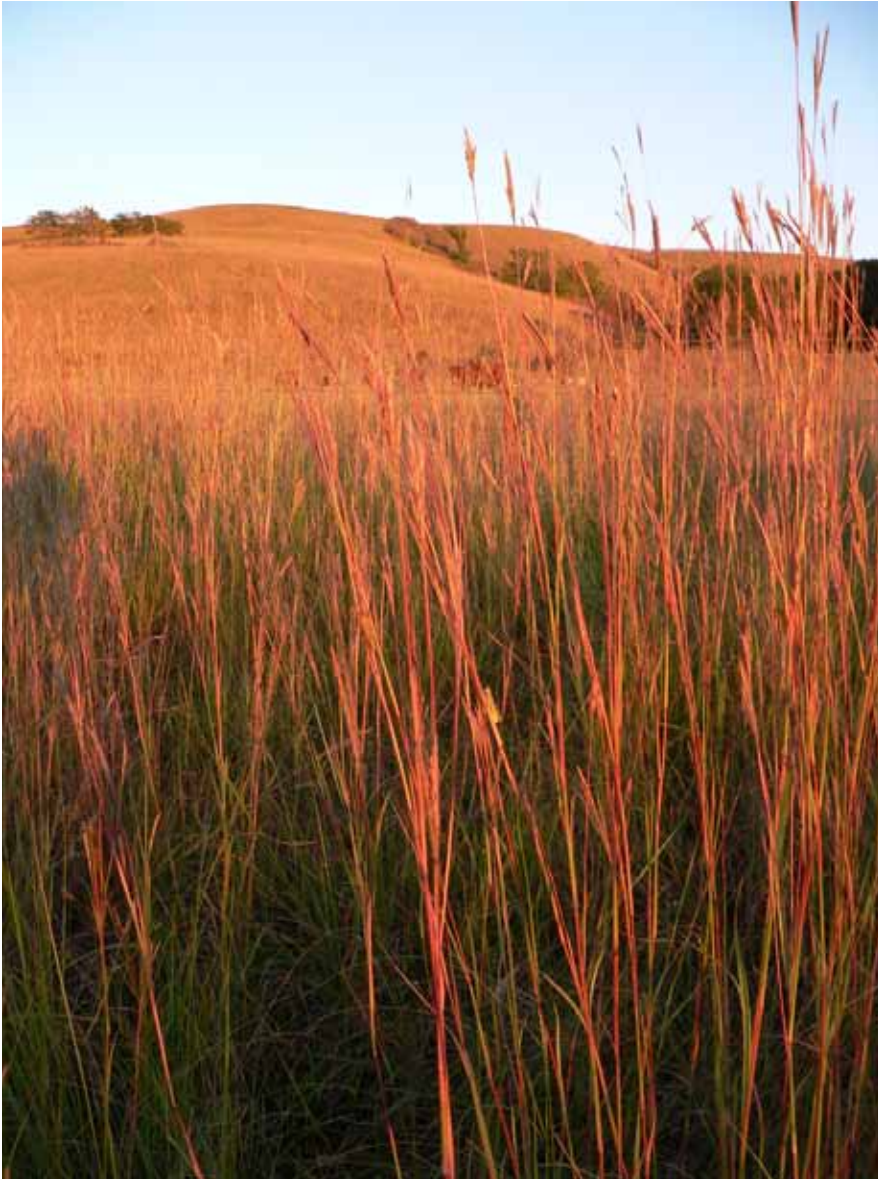
Tall grass prairie.

resources; and the additional resources listed in Appendix C: Sources of Information Pertaining to Methods to Assess Impacts to Wildlife of this document, or through contact of agencies and NGOs, to determine the presence of high priority habitats for species of concern or conservation areas.