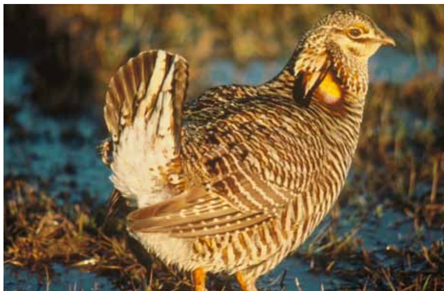
Attwater's prairie chicken.

Some areas may be inappropriate for large scale development because they have been recognized according to scientifically credible information as having high wildlife value, based solely on their ecological rarity and intactness (e.g., Audubon Important Bird Areas, The Nature Conservancy portfolio sites, state wildlife action plan priority habitats). It is important to identify such areas through the tiered approach, as reflected in Tier 1, Question 2 below. Many of North America's native landscapes are greatly diminished, with some existing at less than 10 percent of their pre-settlement occurrence.