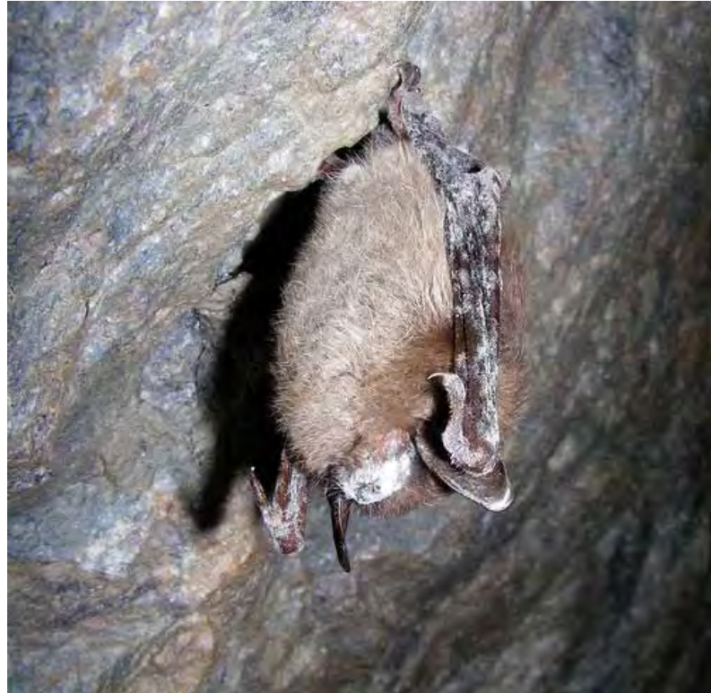
Little brown bat with white nose syndrome.