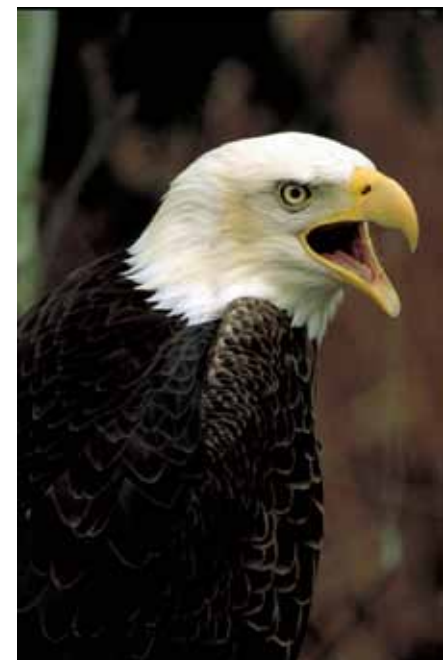
Bald eagle.

The ESA has provisions that allow for compensation through the issuance of an Incidental Take Permit (ITP). Under the ESA, mitigation measures are determined on a case by case basis, and are based on the needs of the species and the types of effects anticipated. If a federal nexus exists, or if a developer chooses to seek an ITP under the ESA, then effects to listed species need to be evaluated through the Section 7 and/or Section 10 processes. If an ITP is requested, it and the associated HCP must provide for minimization and mitigation to the maximum extent practicable, in addition to meeting other necessary criteria for permit issuance. For further information about compensation under federal laws administered by the Service, see the Service’s Habitat and Resource Conservation website http://www.fws.gov/habitatconservation .