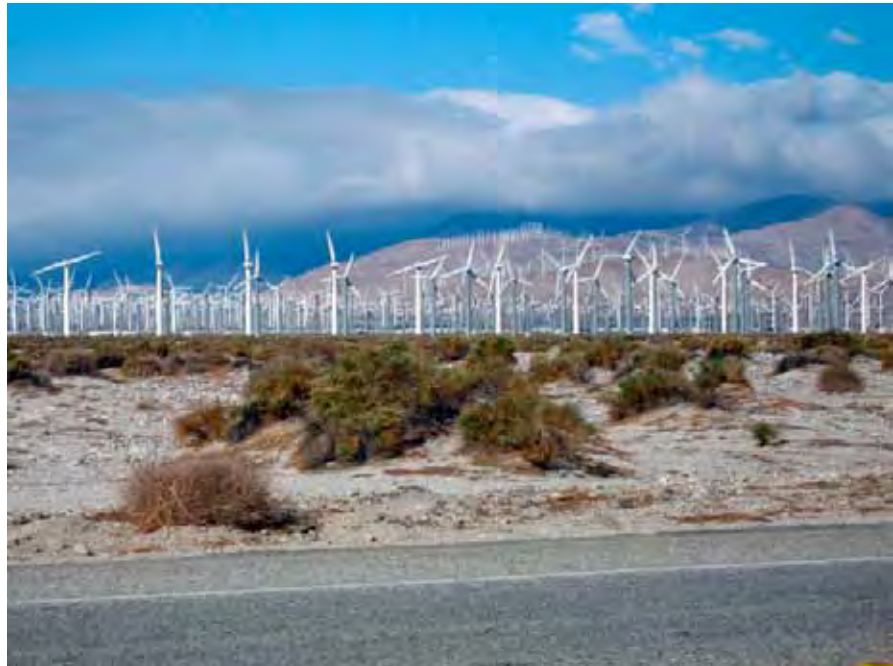
Rows of wind turbines.

Specific study designs will vary from site to site and should be adjusted to the circumstances of individual projects. Study designs will depend on the types of questions, the specific project, and practical considerations. The most common considerations