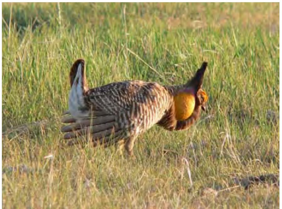
Greater prairie chicken.

To the extent that a federal nexus with a wind project exists, for example, developing a project on federal lands or obtaining a federal permit, the lead federal action agency should make its decision based in part on a developer's commitment to mitigate adverse environmental impacts. The federal action agency should ensure that the developer adheres to those commitments, monitors how they are implemented, and monitors the effectiveness of the mitigation. Additionally, the lead federal action agency should make information on mitigation monitoring available to the public through its web site;