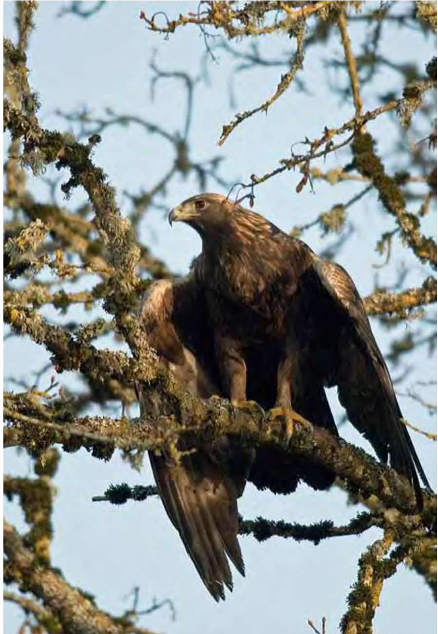
Golden eagle.

by the project, or lost due to various types of mortality including collisions with turbine blades.