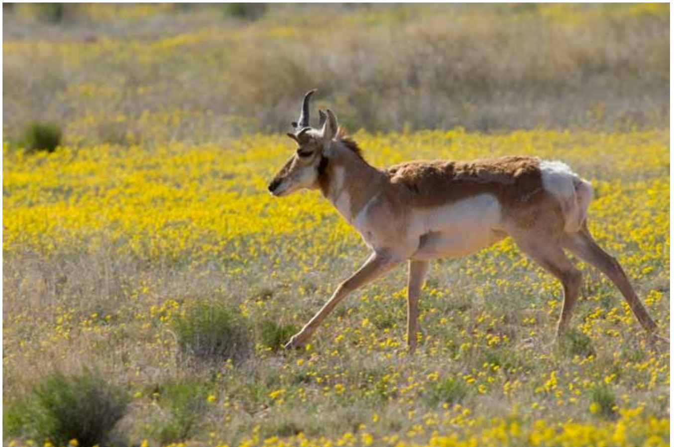
Pronghorn Antelope.

with the goals of the wildlife statutes that the Service is responsible for implementing. The Service will continue to work with states, tribes, and other local stakeholders on map-based tools, decision-support systems, and other products to help guide future development and conservation. Additionally, project proponents should utilize any relevant guidance of the appropriate jurisdictional entity, which will depend on the species and resources potentially affected by proposed development.