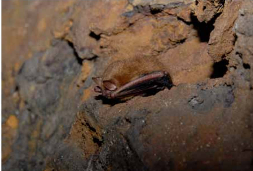
Tri-colored bat.

Service will be needed to determine whether acoustic monitoring is warranted at a proposed project site.