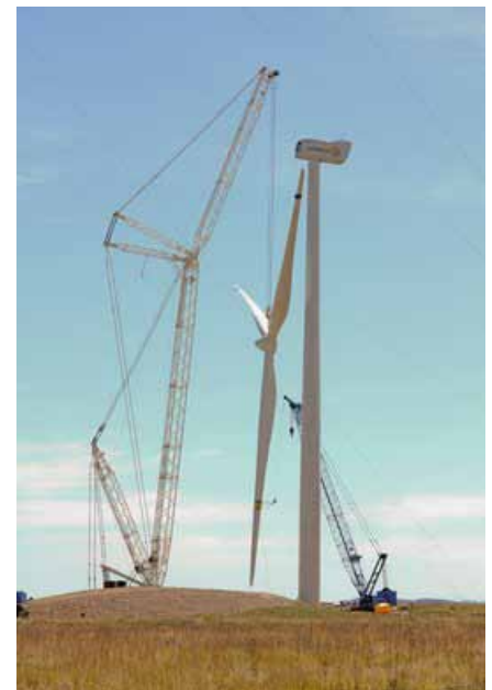
Towers are being lifted as work continues on the 2 MW Gamesa wind turbine that is being installed at the NWTC.