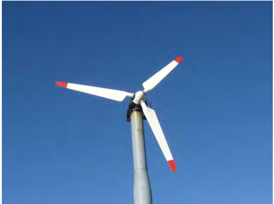
Wind turbine in California..

The Service will explore opportunities to: