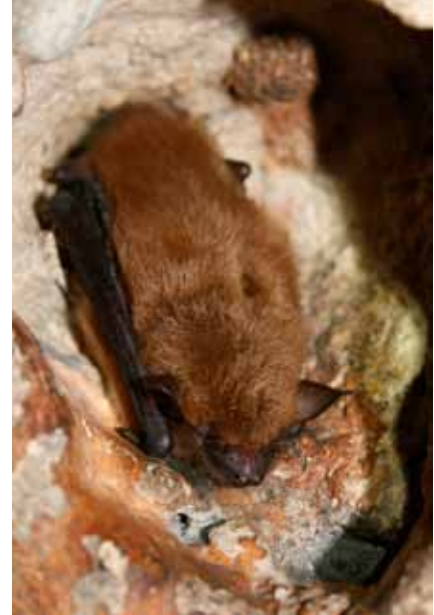
Big brown bat.

Comparing fatality rates among facilities with similar characteristics can be useful to determine patterns and broader landscape relationships. Developers should communicate with the Service to ensure that such comparisons are appropriate to avoid false conclusions. Fatality rates should be expressed on a per nameplate MW or some other standardized metric basis for comparison with other projects,