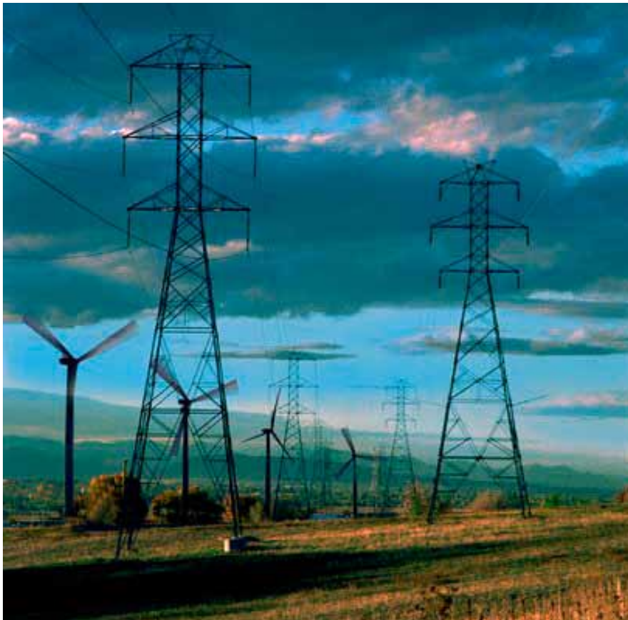
Electricity towers and wind turbines.

The Guidelines are designed to address all elements of a wind energy facility, including the turbine string or array, access roads, ancillary buildings, and the above- and below-ground electrical lines which connect a project to the transmission system. The Service recommends that the project evaluation include consideration of the wildlife- and habitat-related impacts of these electrical lines, and that the developer include measures to reduce impacts of these lines, such