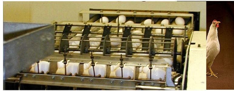
Layers 2013 study States*

Participants with an inventory of 3,000 or more laying hens in 19 States (see map) will be asked to provide important health and management information to characterize the table-egg layer industry. Data collection will begin June 2013. Representatives from APHIS will interview table-egg layer producers to complete a questionnaire.