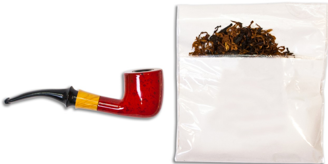
Pipe and Pipe Tobacco

19. ¿Fumar tabaco en pipa es menos dañino, es igual de dañino o es más dañino que fumar cigarrillos?