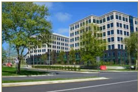
View of the National Cancer Institute from the bus stop on Medical Center Drive