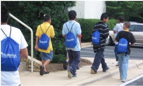
Light slow, easy movement