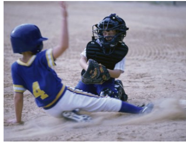
Moderate medium pace movement