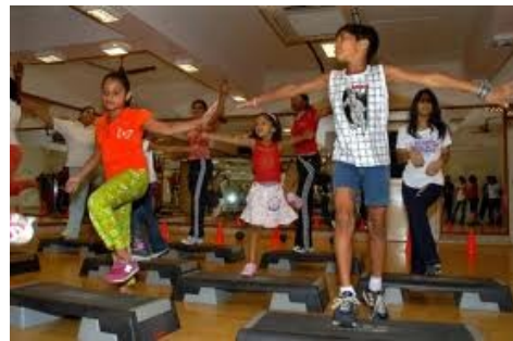
Moderate medium pace movement