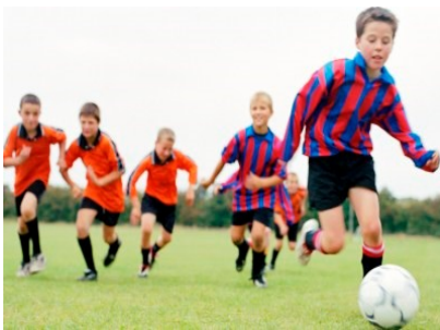
Hard fast pace movement