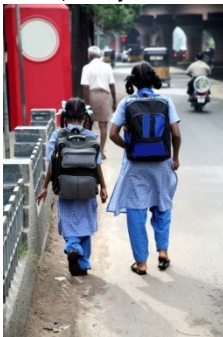
Light slow, easy movement