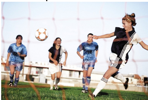
Hard fast pace movement