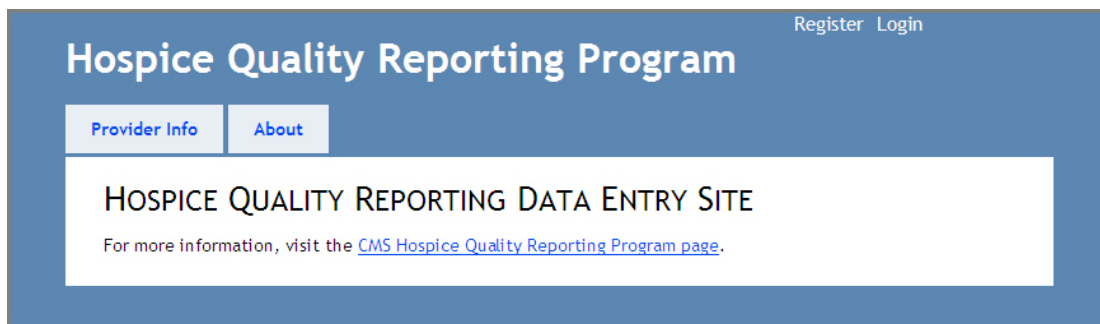
Figure 2. Hospice Quality Reporting Data Entry Site Home Page

NOTE: It might be helpful to bookmark or add this page to your Favorites for easy future access.