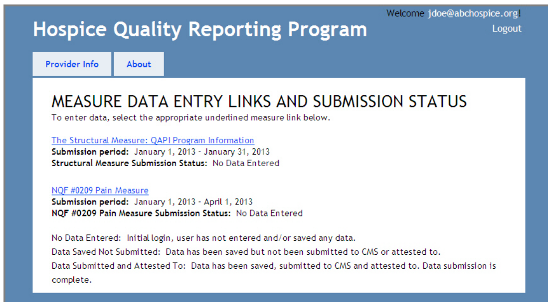
Figure 7. Measure Data Entry Links And Submission Status Page

The Measure Data Entry Links And Submission Status page presents the following links with which you may independently access the Hospice Quality Reporting Data Entry Site pages to enter specific QRP measure data: