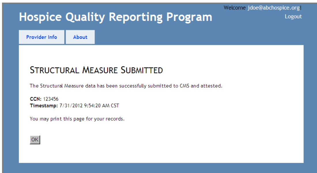
Figure 11. Measure Submitted Page

The Measure Submitted page indicates that your measure data were successfully submitted to CMS and attested. It includes your hospice's CCN and the date and time the data submission and attestation were successfully completed.