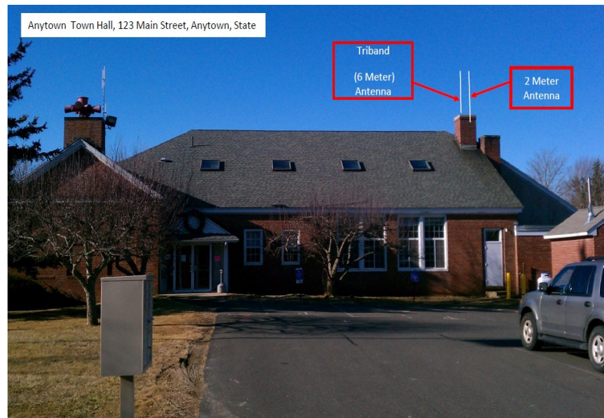
Figure 2. Example of ground-level photograph showing proposed attachment of new equipment

Ground-level photographs. The ground-level photograph in Figure 2 supplements the aerial photograph in Figure 1, above. Combined, they provide a clear understanding of the scope of the project. This photograph has the name and address of the project site, and uses graphics to illustrate where equipment will be installed.