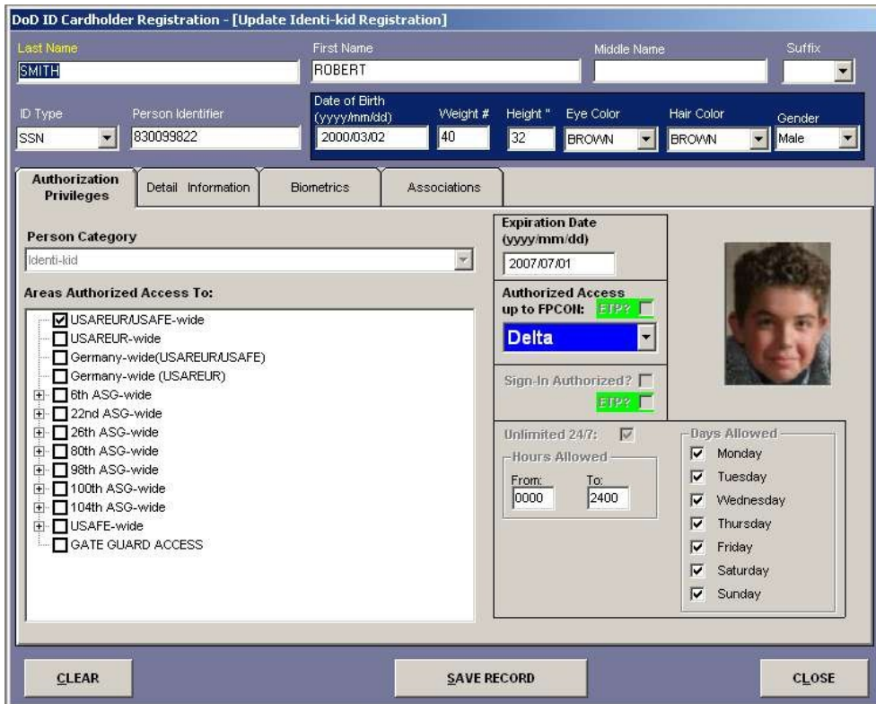
Figure 9. Authorization Privileges Screen – Identi-kid