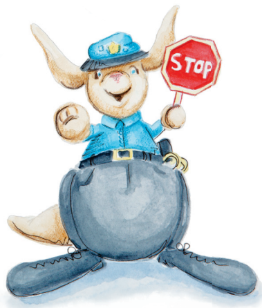
I can be a policeman.