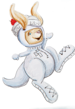
I can be an astronaut.