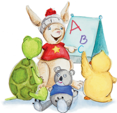
I can be a teacher.