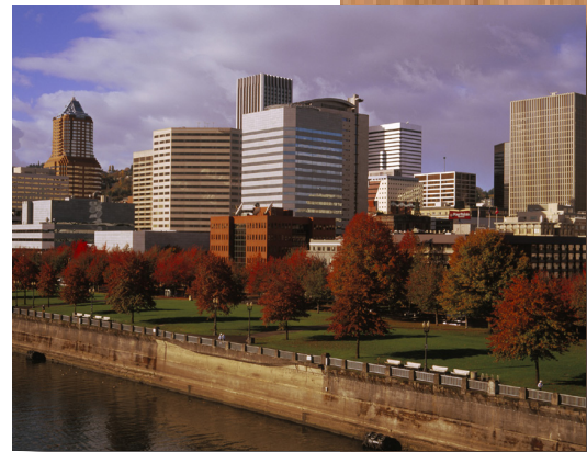
Portland, OR, waterfront

Urban Waters Federal Partnership. Many of our Nation’s urban rivers, streams, lakes, forests, and wetlands are polluted, degraded or inaccessible. Research demonstrates that a clean, safe, accessible, urban environment—including urban forests, gardens, parks, lakes, aquifers, and rivers—is directly linked to improved public health, stronger local economies, and lower crime rates. Through the Urban Waters Federal Partnership, the Forest Service and 11 other Federal agencies are revitalizing urban waters, supporting local partnerships, restoring forest resources, fostering community engagement in urban watersheds, and transforming overlooked assets into drivers of urban revival at seven pilot locations across the country. Nearly $1 million has been committed to accomplishing these goals.