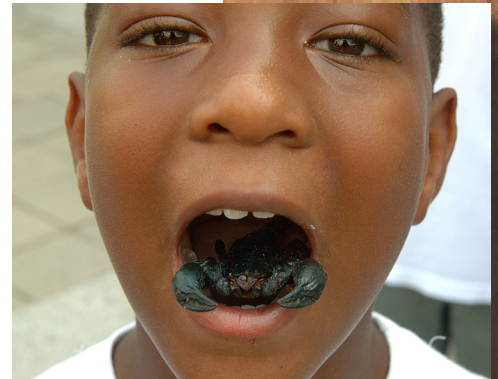
Child taste-tests a scorpion at the museum's BugFest event.

North Carolina Museum of Natural Sciences Partnership. Demystifying research science is necessary to engage teachers and students – and ultimately to inspire a new generation of young scientists. The Forest Service's Southern Research Station (SRS) is an inaugural partner with the North Carolina Museum of Natural Sciences' new 80,000 square-foot wing, the Nature Research Center (NRC), in Raleigh, NC. SRS is leveraging an initial two-year investment of $130,000 toward the NRC's more than $2 million annual budget, into ground-floor access to 21 st century technological resources, and integrating scientific exploration to expose and engage more than one million multicultural students to the wonders of forest science. SRS scientists will have several platforms available – including science cafés, distant learning projects, special forestry themes, and the immersive, three-story multimedia Daily Planet hub – to share the research behind contemporary issues and emphasize how forests address societal concerns. SRS and NRC scientific experts will jointly unfold cutting-edge research and technology to bright young minds eager to absorb science in action. And the fun extends beyond the museum's walls! Through special live video feeds and hands-on activities, the wonders of forest science will be potentially broadcast into schools, libraries, senior citizen centers, hospitals, and other community organizations, stimulating an interest in forests and exciting children and adults alike.