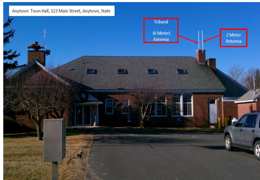
Figure 2. Example of ground-level photograph showing proposed attachment of new equipment

Ground-level photographs. The ground-level photograph in Figure 2 supplements the aerial photograph in Figure 1, above. Combined, they provide a clear understanding of the scope of the project. This photograph has the name and address of the project site, and uses graphics to illustrate where equipment will be installed.