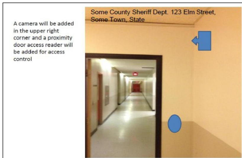
Figure 6. Interior photograph showing proposed location of new equipment.

Interior equipment photographs. The example in Figure 6 shows the use of graphic symbols to represent security features planned for a building. The same symbols are used in the other pictures where the same equipment would be installed at other locations in/on the building. This example includes the name of the facility and its physical address.