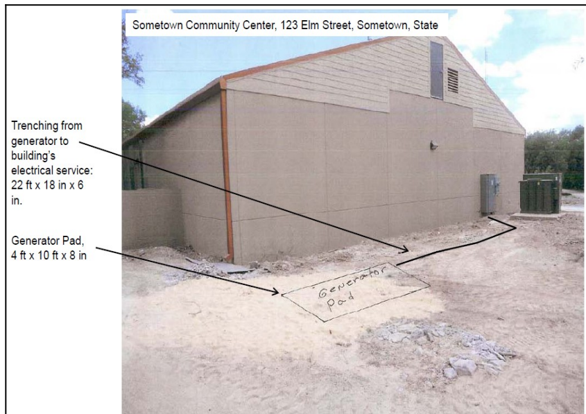
Figure 4. Ground-level photograph showing proposed ground disturbance area.

The example in Figure 4 shows the proposed location for the concrete pad for a generator and the ground disturbance to connect the generator to the building's electrical service. This information can be illustrated with either an aerial or ground-level photograph, or both. This example has the name and physical address of the project site.