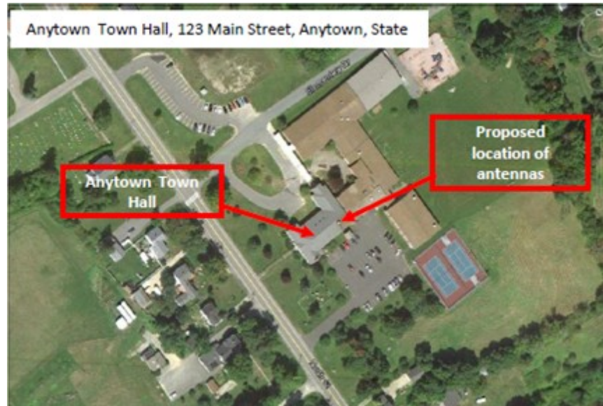
Figure 1. Example of labeled, color aerial photograph.

Aerial Photographs. The example in Figure 1 provides the name of the site, physical address and proposed location for installing new equipment. This example of a labeled aerial photograph provides good context of the surrounding area.