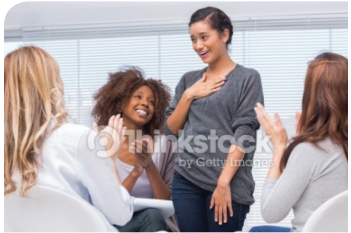
Better diagnosis and treatment can improve mental health among women of reproductive age.

Age 15-44 is considered "reproductive age."