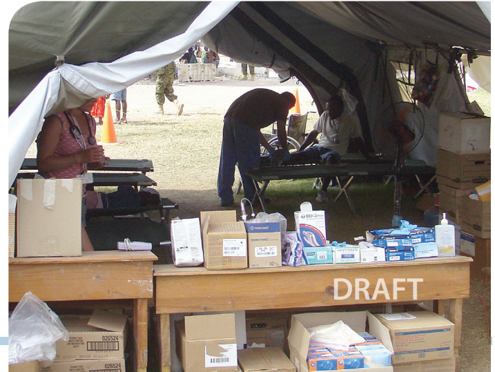
CDC healthcare response team providing supplies to a community.

Environmental health practitioners and others should sign up now for the Environmental Health Training in Emergency Response (EHTER) to learn how to respond to environmental health threats during disasters.