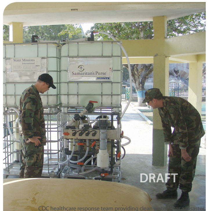
CDC healthcare response team providing clean water to a disaster area.