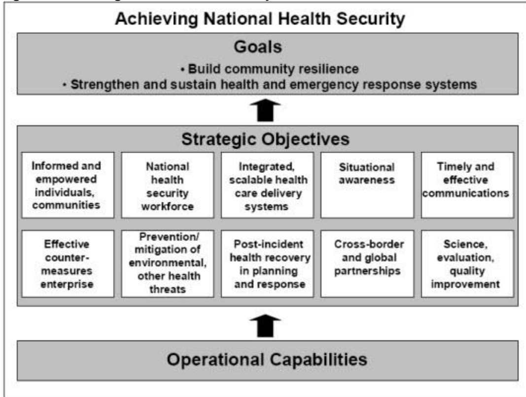
Figure 1. Achieving national health security

review are relevant to many of the other objectives (e.g., national health security workforce, effective countermeasures enterprise).