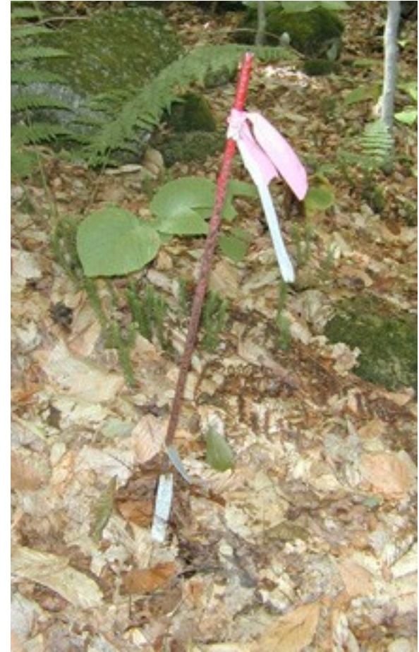
A site corner marked with painted rebar and colored flagging tape