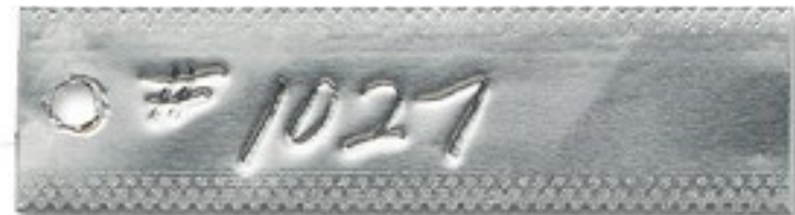
Aluminum tree tags.