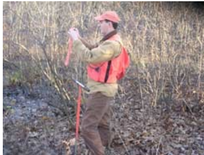
Using flagging tape to mark plants.