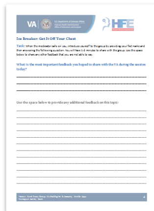
Activity Book Page 4: Ice Breaker

[Moderator: Call on each participant, by first name, in a “round robin” fashion and pose the question above. Allow each participant 1-2 minutes to provide their answer.]