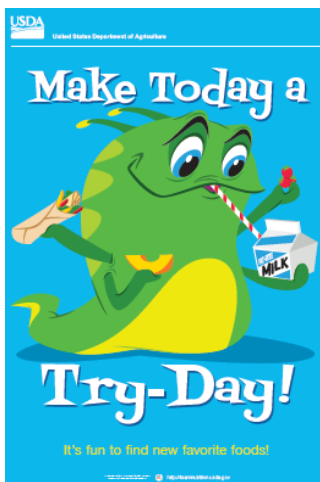
Poster Concept 3: Try-Day