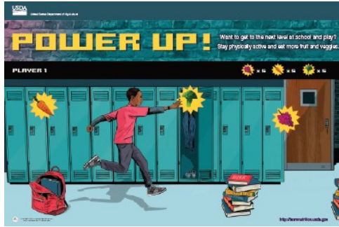
Poster Concept 1: Power Up – A