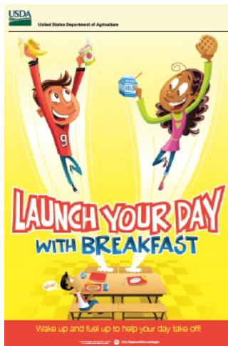
Poster Concept 1: Launch Your Day