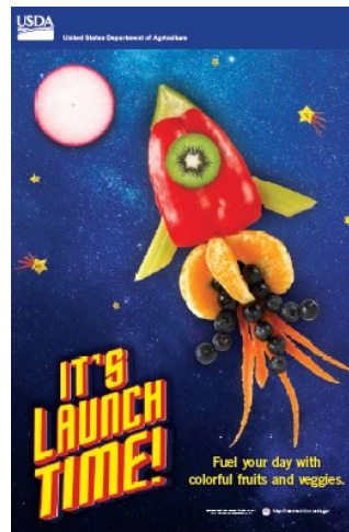
Poster Concept 2: Launch Time